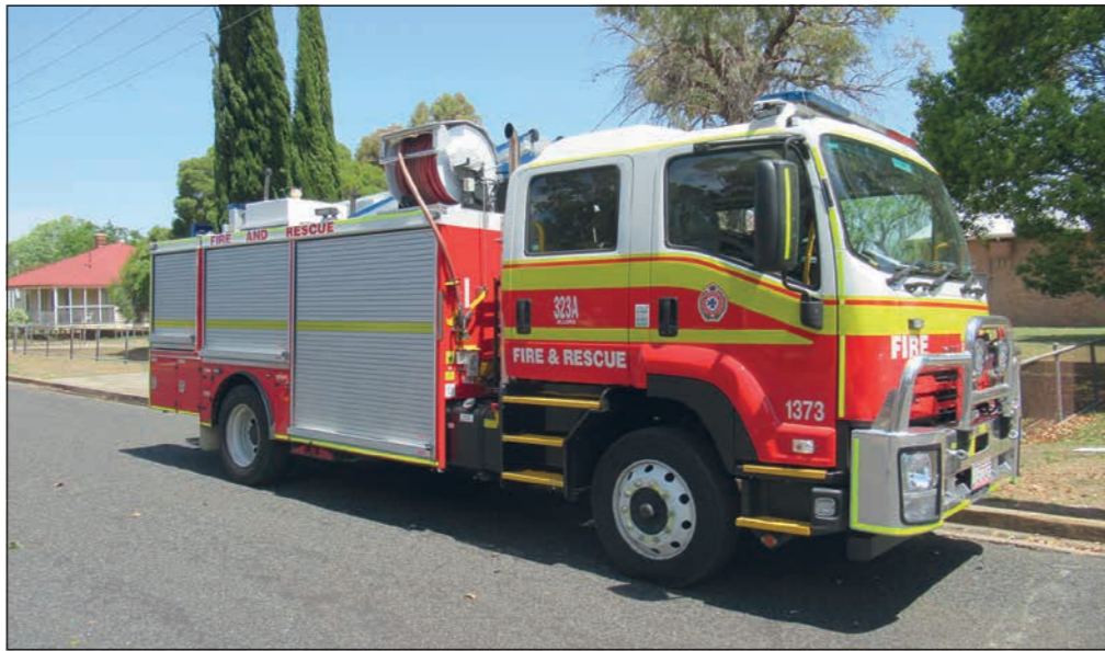
The new Fire Engine now at Allora.

unit was among appliances called to the recent fires on the Granite Belt.