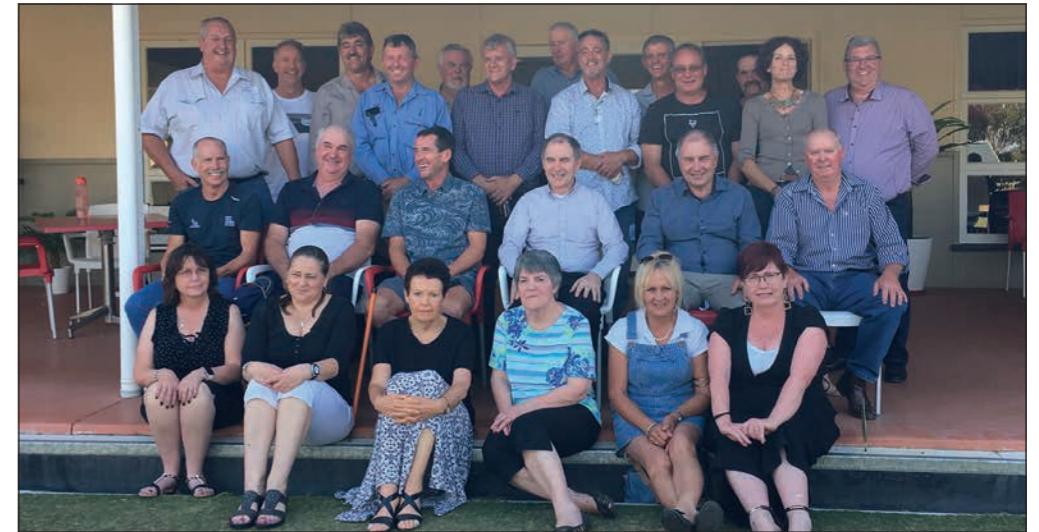
ABOVE: Attendees recreating a school photo taken in 1979.