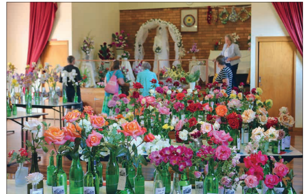
A major attraction is the Iris & Rose Show to be held on Saturday afternoon 19th October.

Due to the popularity last year a train trip to Greenmount and return is on again but you are advised to pre-book with tickets available from the Clifton Railway Info Centre. Residents of the Allora area can be part of the trip if they