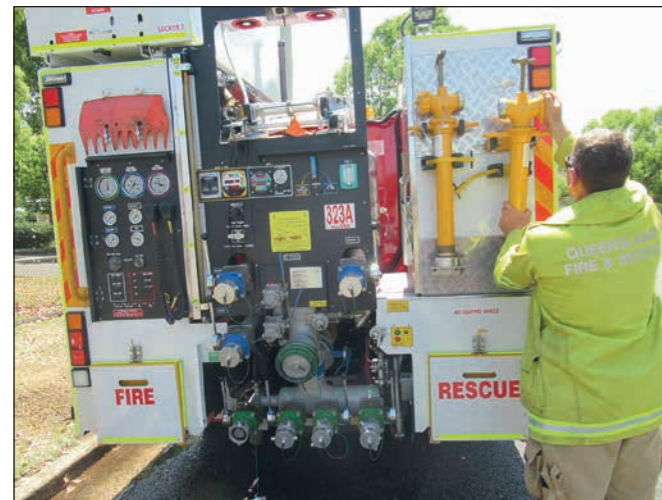
The Compressed Air Foam System (CAFS) on the new Fire Engine uses less water for better efficiency.

unit was among appliances called to the recent fires on the Granite Belt.