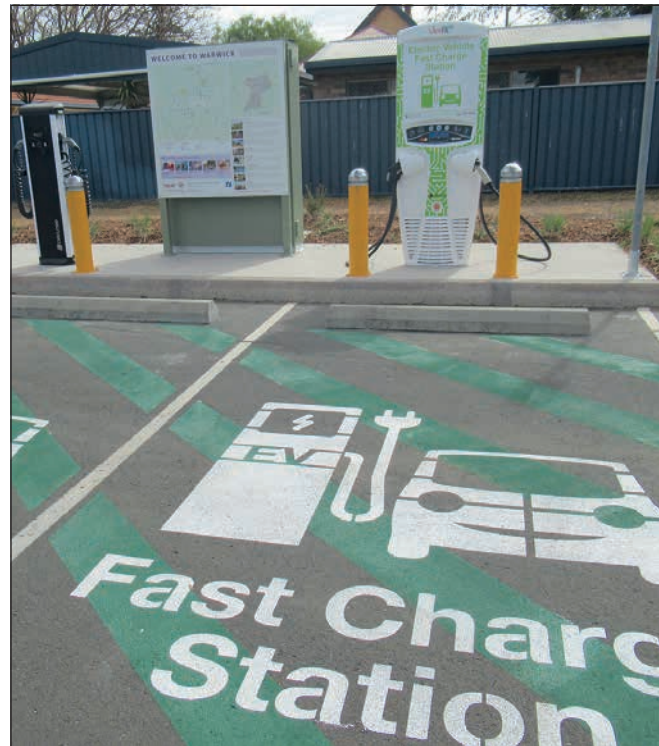
Electric vehicle charging stations in Warwick.

For more information contact SDRC on 1300 697 372.