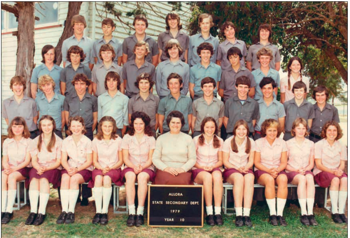
The Allora Secondary Department Year 10 Class of 1979 will celebrate their 40 year reunion with many ex-students returning.