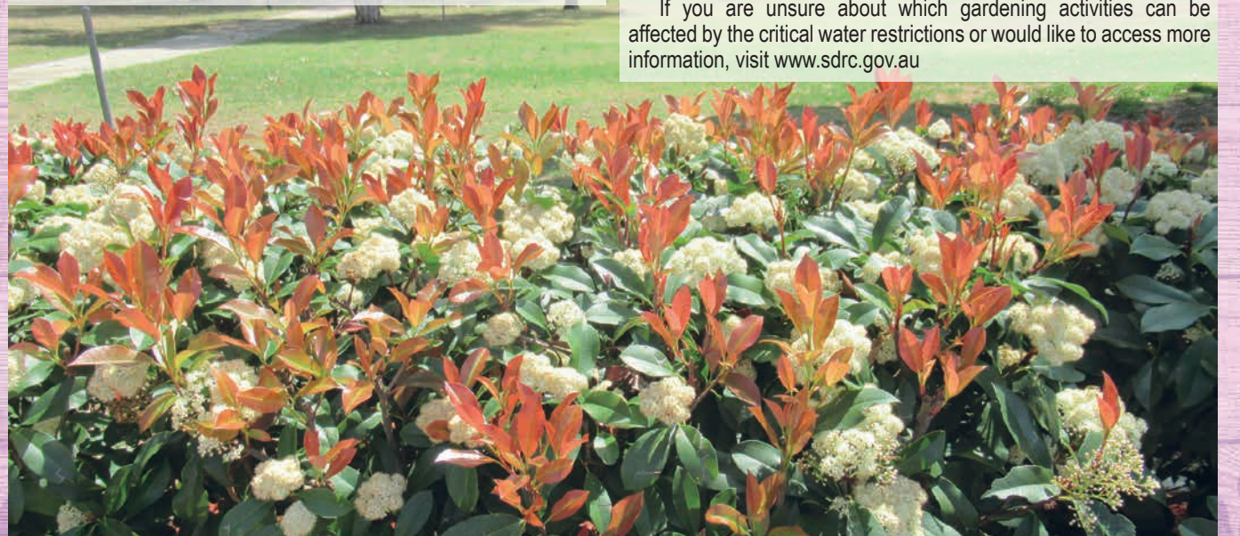
Making a show is the Red Robin hedge in full bloom in Allora's Memorial Park

If you are unsure about which gardening activities can be affected by the critical water restrictions or would like to access more information, visit www.sdrc.gov.au