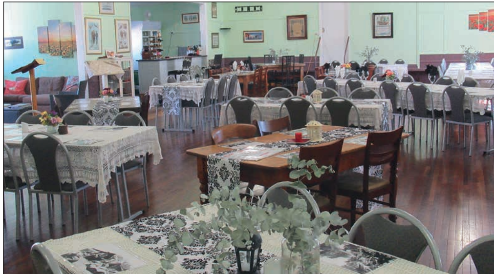
The well-appointed RSL Hall Dining Room

The building was the result of several years of planning and fund raising in the form of 'queen' competitions.