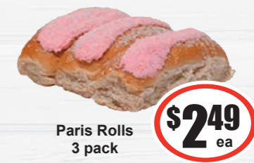
Paris Rolls 3 pack