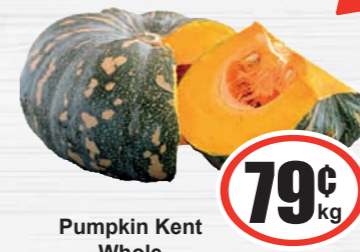
Pumpkin Kent Whole