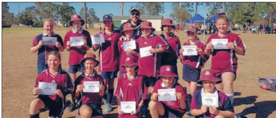
ABOVE: Senior Soccer team that won on the Central Downs Gala Day.