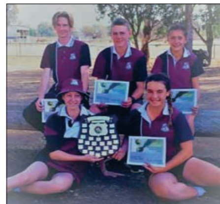
RIGHT: Some of the athletes who competed in the Border District Carnival held in Warwick recently.