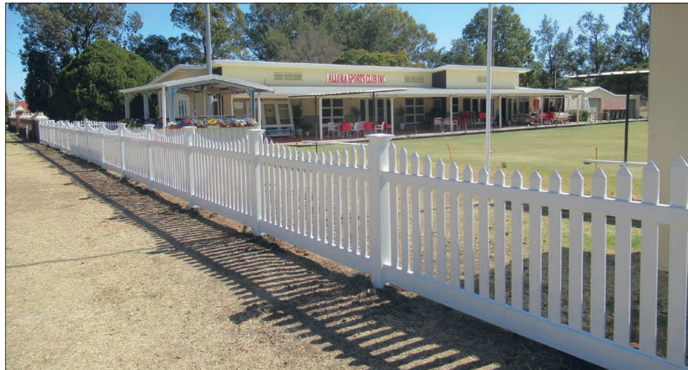
A new heritage style fence erected at The Allora Sports Club.

The Allora Sports Club is continuing to improve clubhouse facilities for members and guests with the installation of much more functional bi-fold doors together with a new air conditioning system. It has also erected a new heritage style fence across the front of the clubhouse and the old Croquet Hut which adds to the charm and character of the old buildings and the bowls green. Visitors to our town cannot help but be impressed when this is the