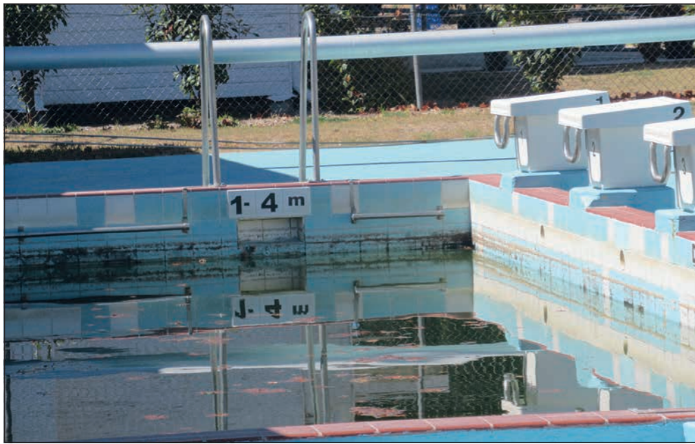
Water in the Allora pool has deteriorated during the winter closure and will need to be replaced for the coming season to ensure it is safe for swimming.

"Council believes that the region's swimming pools provide immense community and social benefits, especially with the expected hot, dry summer months ahead," Mayor Dobie said.