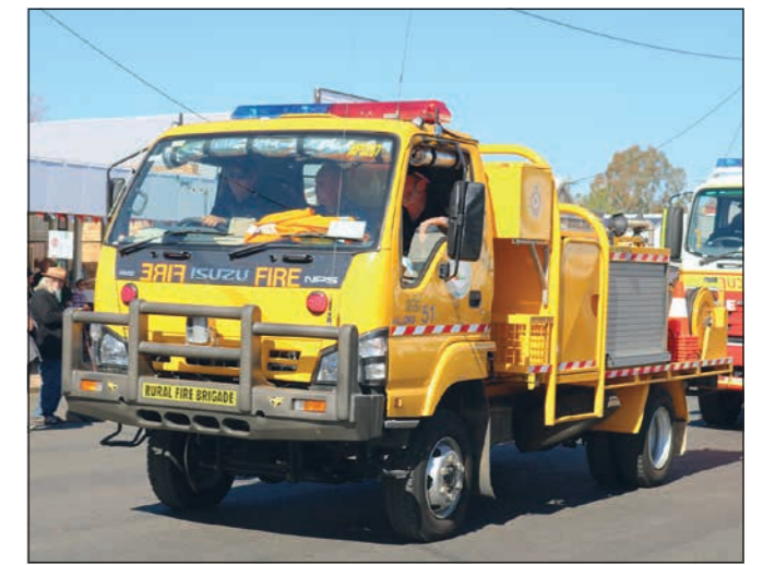
Allora & District Rural Fire Brigade.

If you're interested there's training every Wednesday at the Allora Fire and Rescue Station in Muir Street or you're welcome to attend The Allora Rural