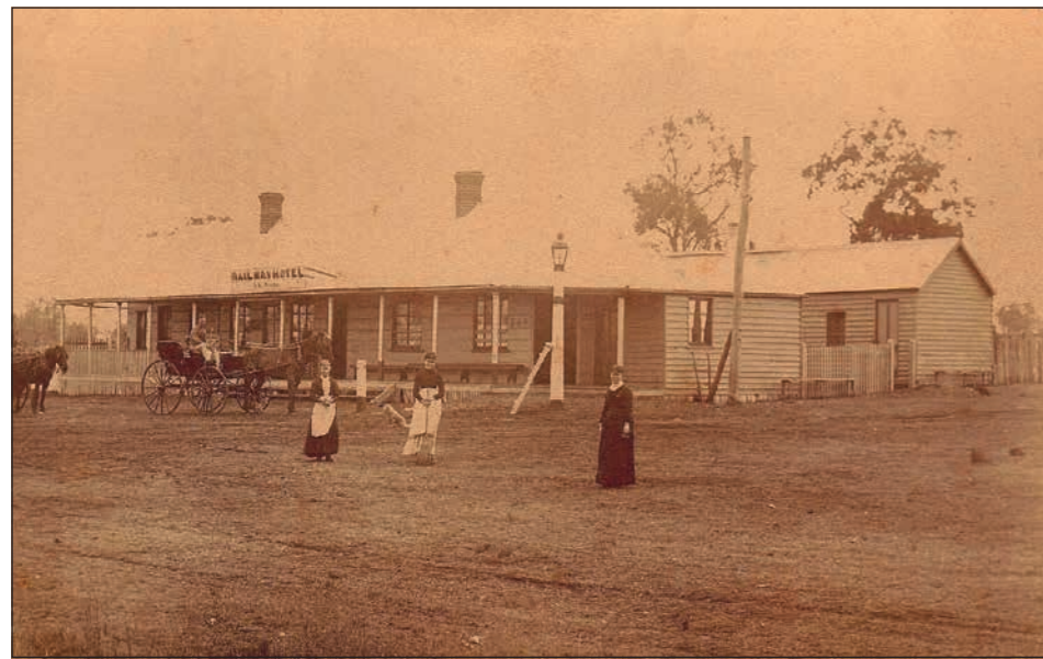
The Railway Hotel at Hendon.

Everywhere paddocks of young wheat are making good progress.