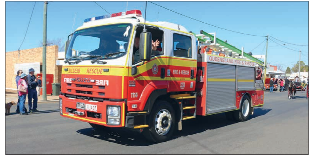
Allora Auxiliary Fire Brigade.

Be sure your first aid kit is stocked and protective clothing on hand. Preparation is the key to survival.