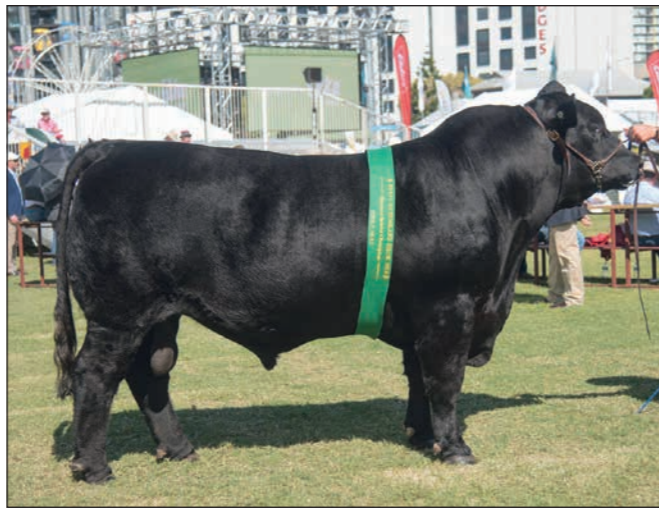
ABOVE: Reserve Senior Champion Angus Bull - Monterey True North N187 SV.