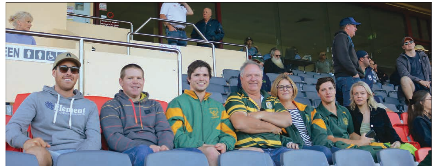
Wattles Fans at Clive Berghofer Stadium to support The Boys on Sunday.