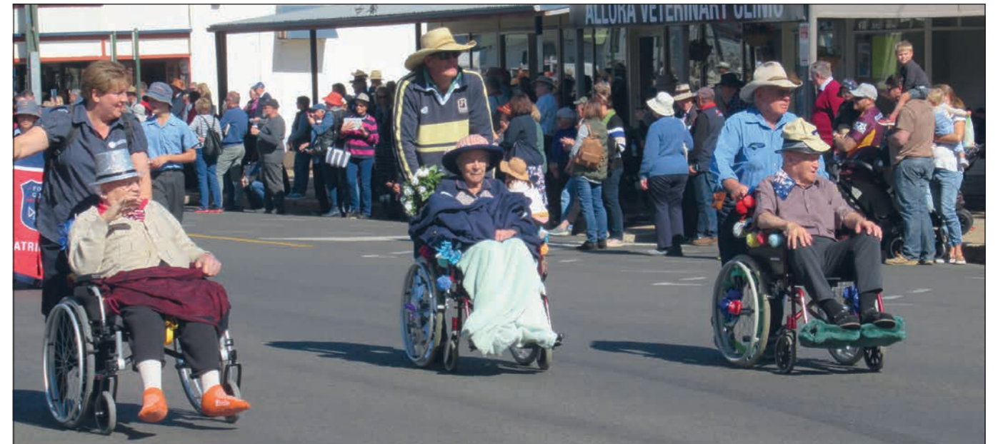
You're never too old to be "hooning" up Herbert Street.