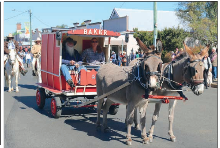
Donkeys delivering the bread! Did this really happen?