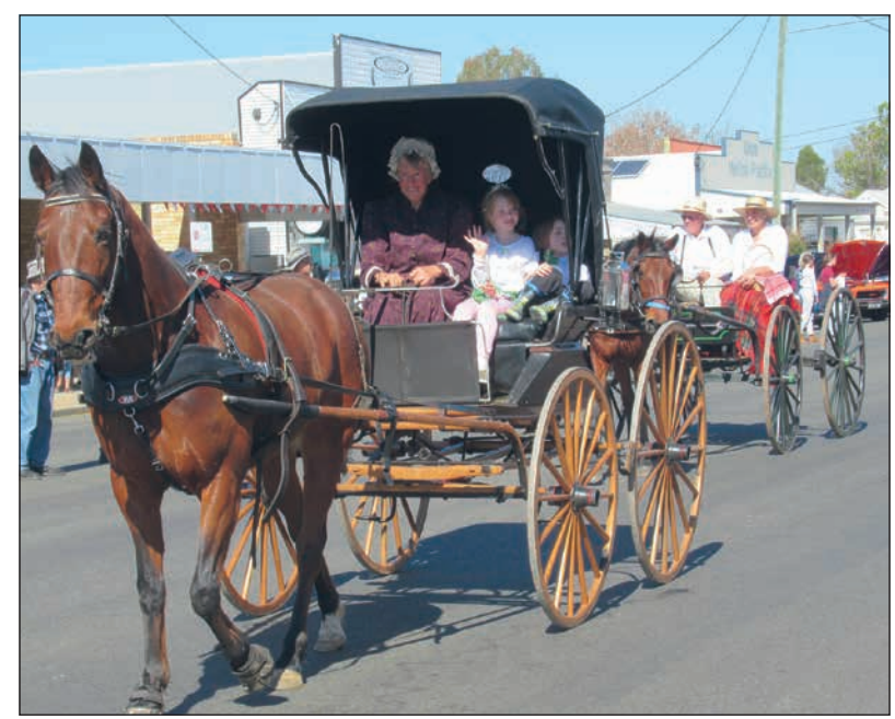
ABOVE: Horse & 100 year old buggy, beautifully presented for the parade. BELOW: Crowds gather to watch the Official Opening of the Celebrations and