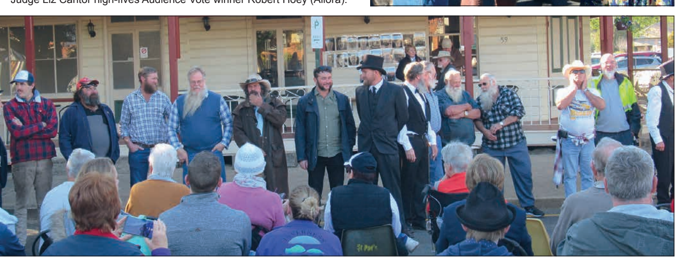
Beard growing contestants under the scrutiny of the crowd for the Audience's Choice award.