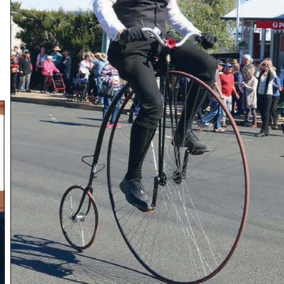
Confidently ridden Penny Farthing bikes were enjoyed by the crowd.