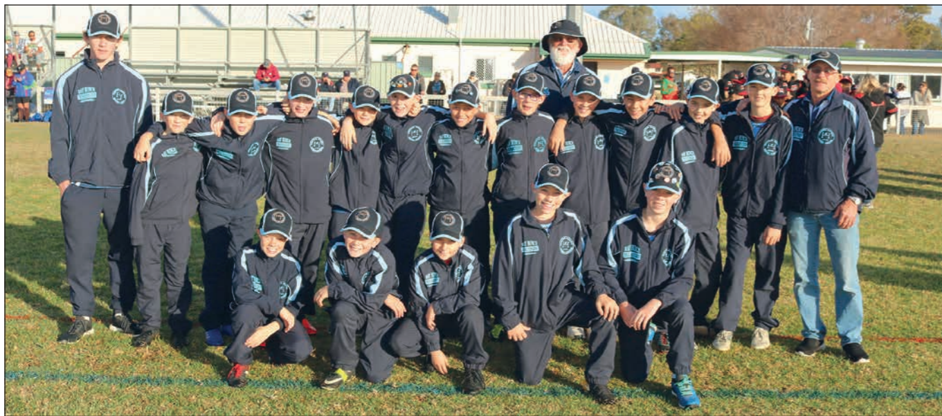
Players in the local Central Downs Under 43kg team lined up for our camera as the Carnival started on Monday.

The Zone 5 Under 43kg Junior Rugby League Carnival has reached the mid-way point with local Central Downs players enjoying the experience.