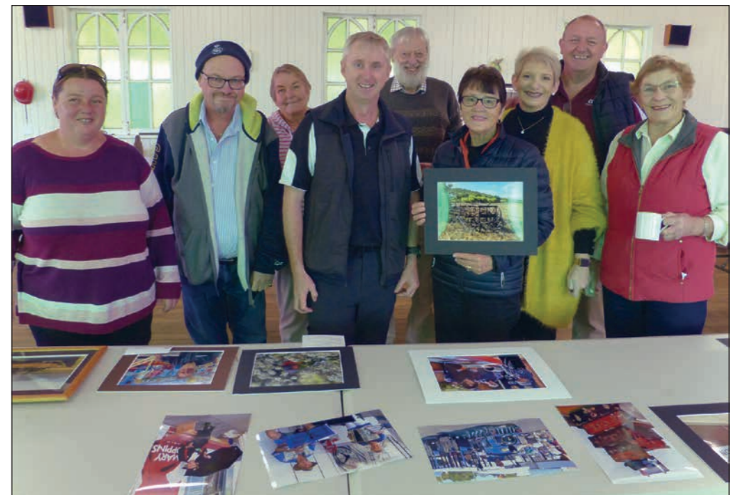
RIGHT: Allora Photography Group members with a selection of photos for the time capsule.