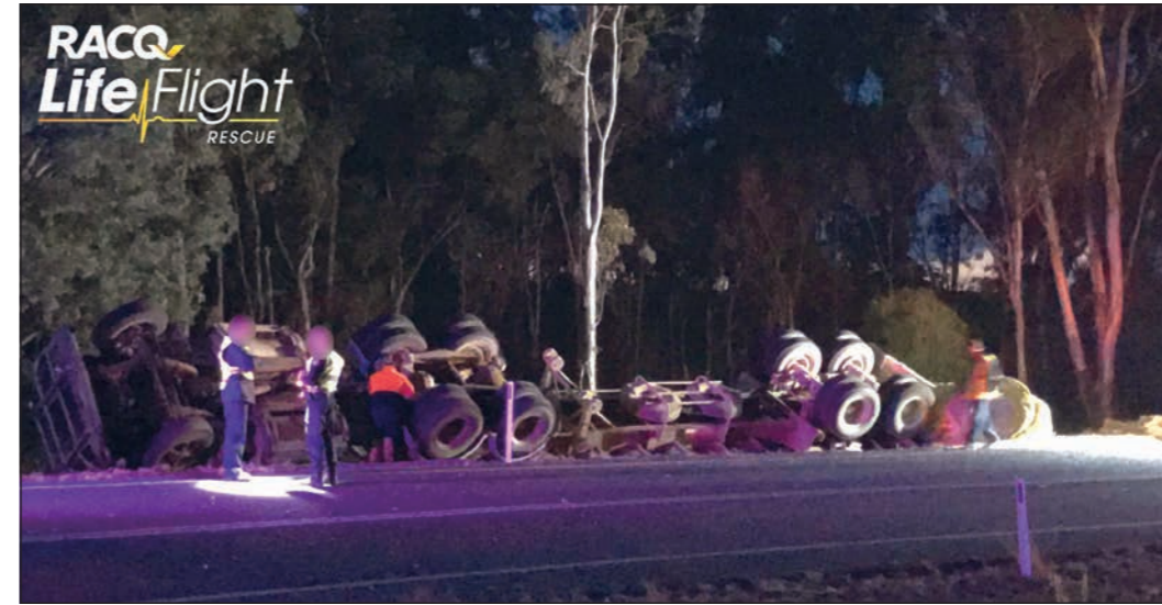
Truck rolled over at Deuchar.

The Toowoomba-based RACQ LifeFlight Rescue helicopter was tasked to a truck rollover in the Southern Downs region late Saturday afternoon.