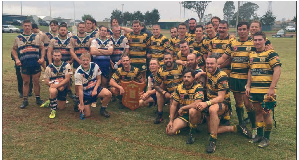
The Wattles and Brothers A Grade sides contested the Dan Ryan Memorial Trophy at Glenholme Park on Sunday, with Wattles emerging victors.