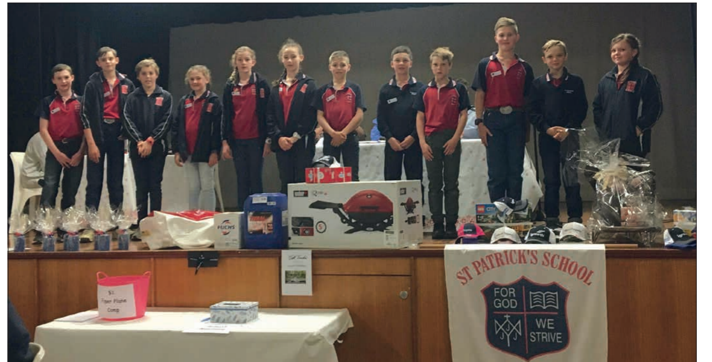
ABOVE: St. Patricks Students helped out on the night.