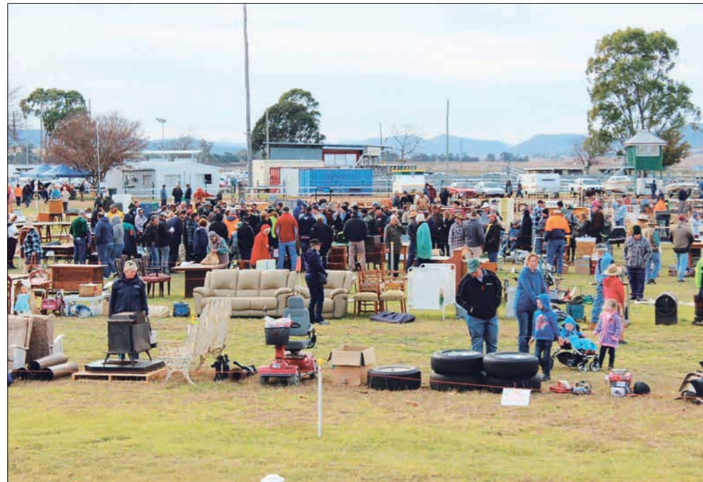
The Allora Community Auction always brings a huge crowd of bargain hunters.

For further information email - allorashowsociety@gmail.com or check out the information on the Allora Show Society website - www.allorashow.org.au