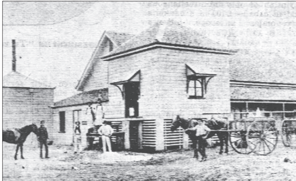
The Central Downs Dairy Factory, Hendon Road, 1897.