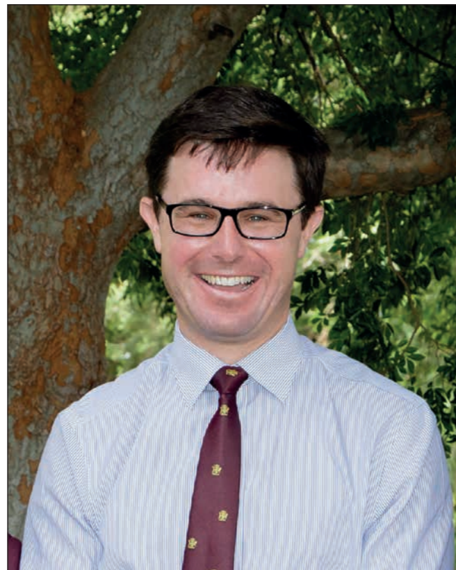
Incumbent Liberal National Party member and Federal Agriculture Minister David Littleproud.