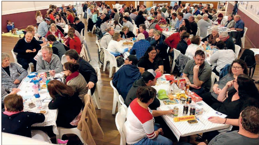
Last year a packed house took part in the St. Patrick's School Rattle of the Brains Trivia Night.

Entry is $15 per person which can be paid at the door. Entry includes Pizza, Nibbles and Supper with tea