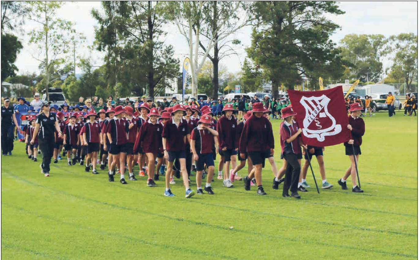
Allora State School leading the march past at the start of the Central Downs Primary School Athletics Carnival. See more carnival photos inside on pages 10 & 11