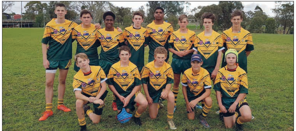
U16 Hamblin Building Junior Warriors.

Steele Rudd Servo's Under 8's. Today our team really played up another gear on their great efforts last week. All of the boys have put the skills learnt at training to good use with great hard straight running & good solid tackling, often with 3 or 4 in each tackle. Jake was the lucky award winner of the canteen voucher through sheer determination in defence & some lovely attacking