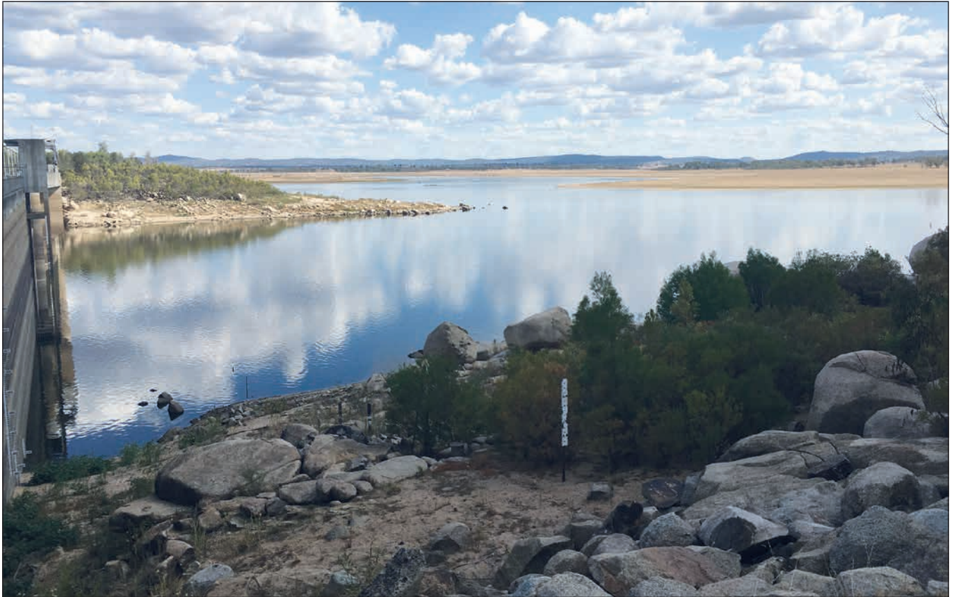
Leslie Dam currently 6.97 per cent capacity.