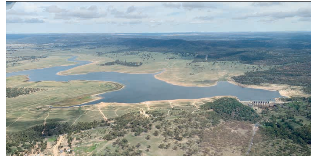
Connolly Dam currently at 44 per cent capacity.