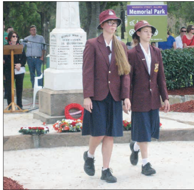
Allora State School students leave the memorial after laying a wreath.