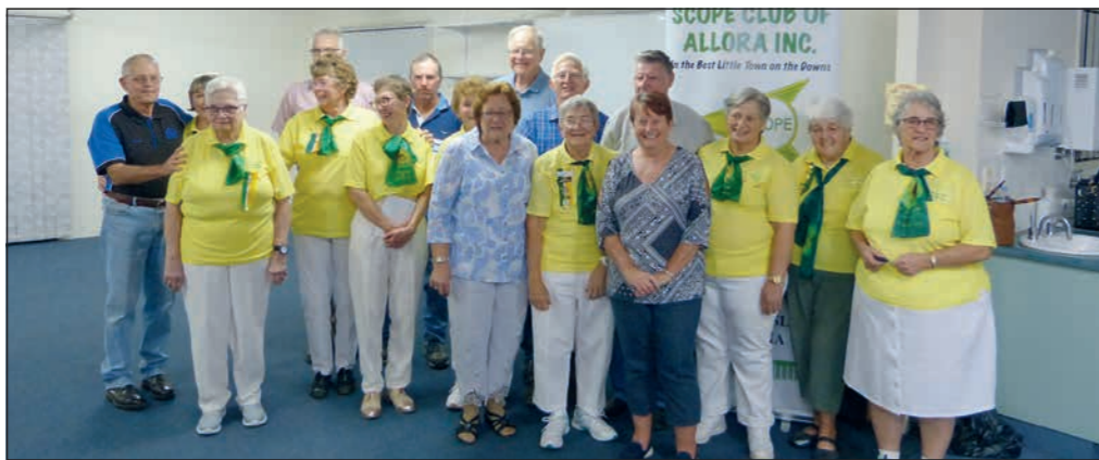
Men's shed and volunteers with Scope members.