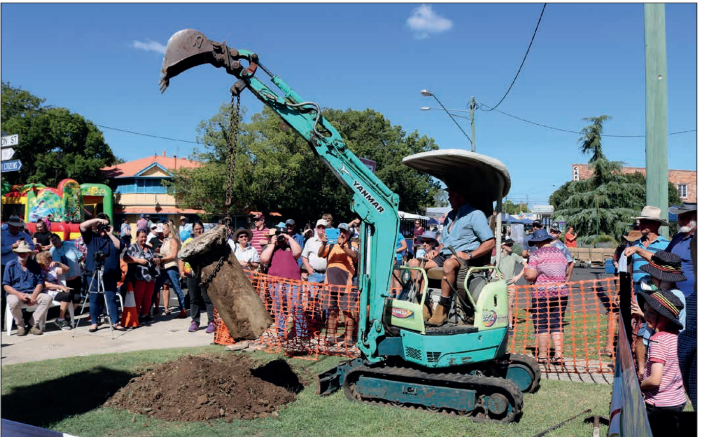
The time capsule being lifted out of the ground in front Allora Regional Sports Museum.