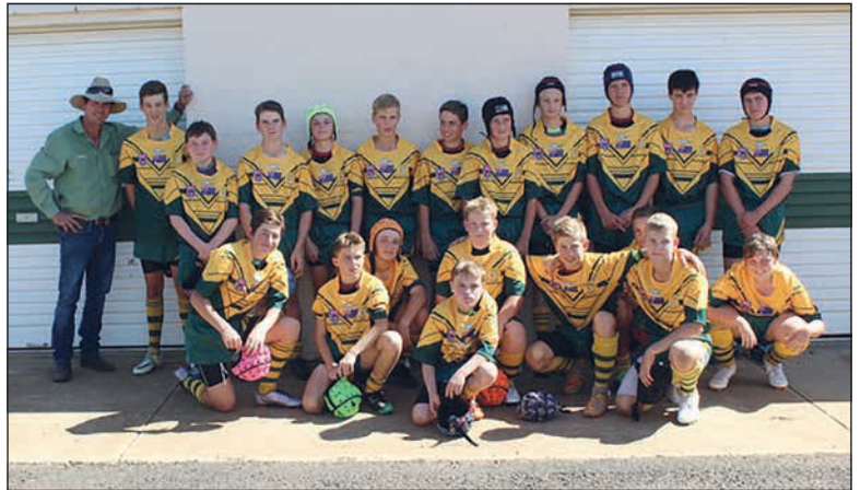
U14s Landmark Harcourts team with their new jerseys and proud sponsor.

Landmark Harcourts U14s. A slow start by the Wattles and we were down by two quick tries, the Wattles lads rallied and started playing the footy they are capable of, with a strong performance from the Wattles team in attack we were down the field and on the scoreboard. The boys played well but struggled to contain the big