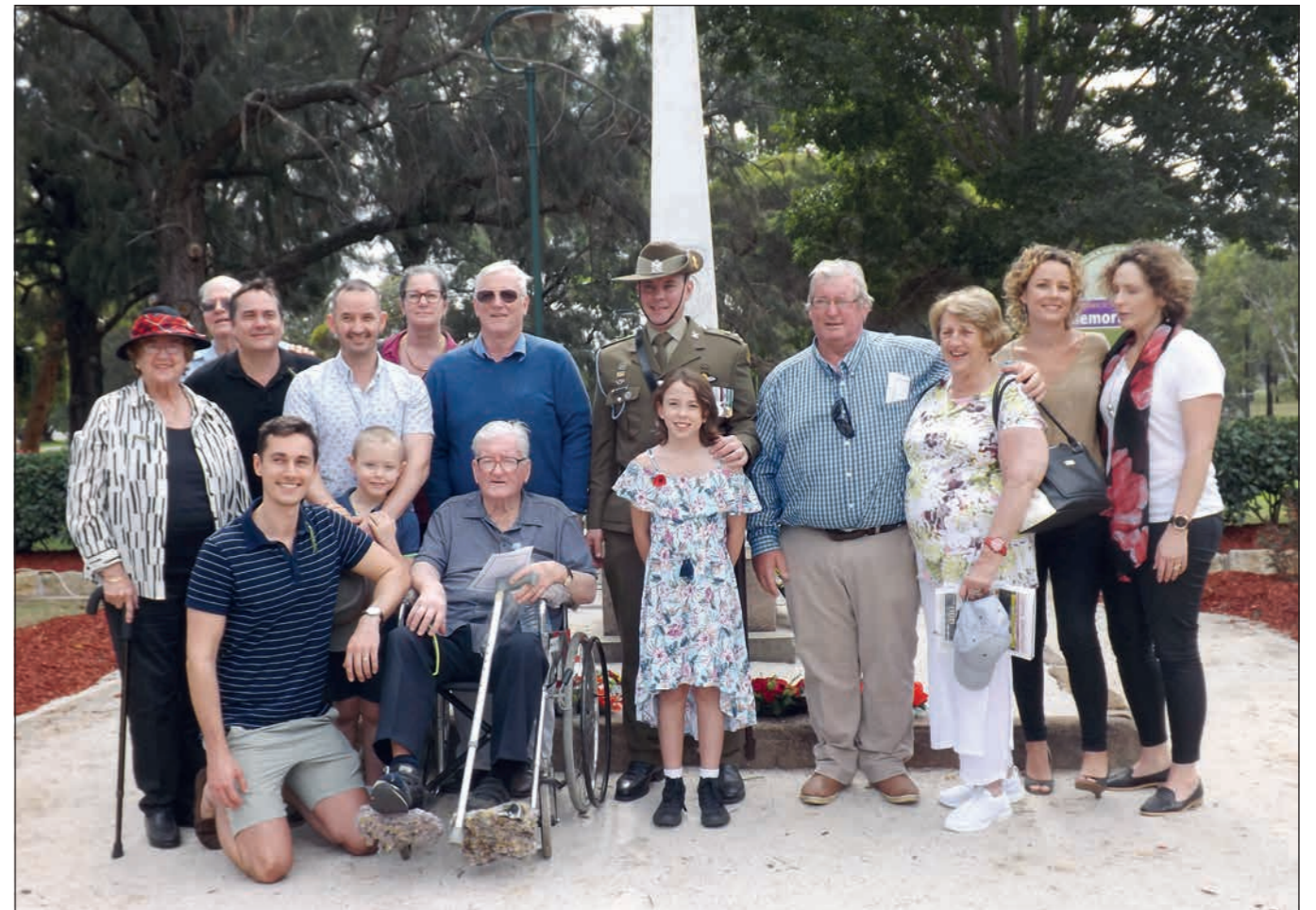
The Cameron family.