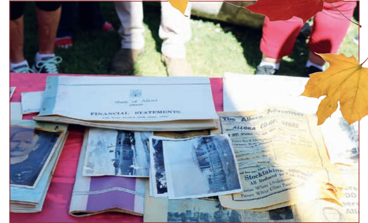
Contents of the time capsule.