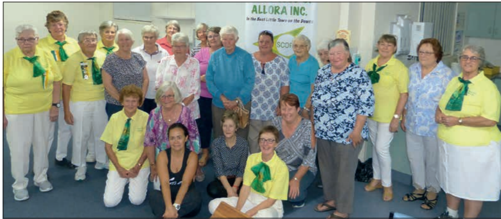
Volunteers with Scope members.

Since opening, the local community and visitors from every state have supported the Op Shop, situated on the corner of Warwick and Forde Streets, Allora - open Tuesday and Friday from 9am until 4pm.