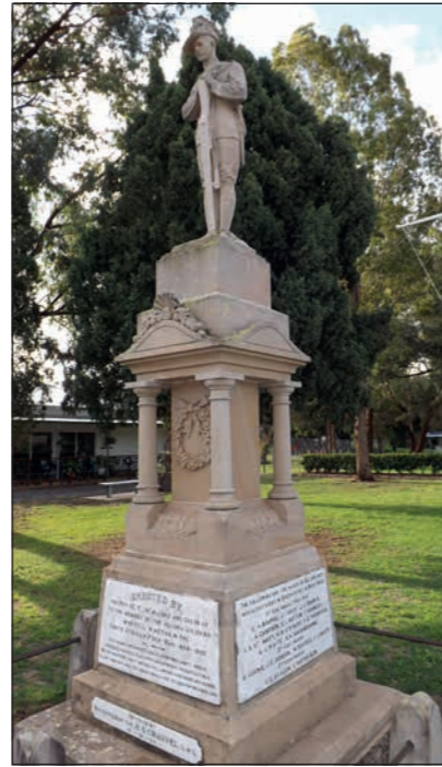
Allora's Boer War Memorial.