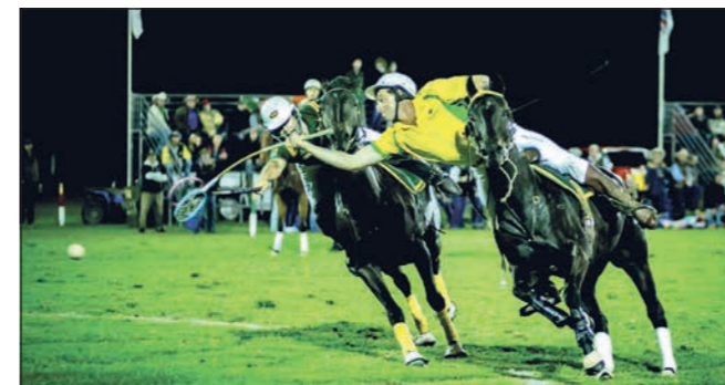
The 2019 Adina Polocrosse World Cup is taking place at Warwick.

Tickets can also be purchased from Crossdraw Western Emporium in Warwick and will be available at the gate.