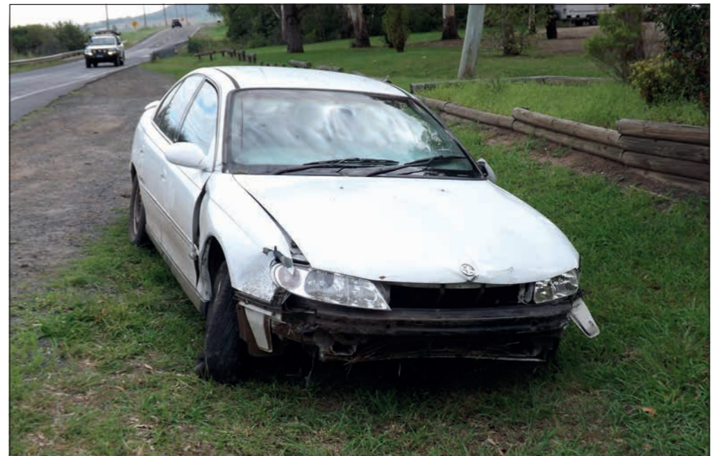
This is the vehicle believed to have been involved in Saturday morning's crash north of Allora, although Allora Police are uncertain as to how it came to be located on the outskirts of Allora.

A Brisbane woman has been charged with two counts after being involved in a road crash north of Allora early on Sunday morning.