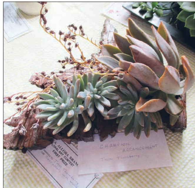
Champion Floral arrangement by Trish Thornberry.

The first meeting of the craft group on Tuesday was very productive with painted eggs and hot cross buns produced.