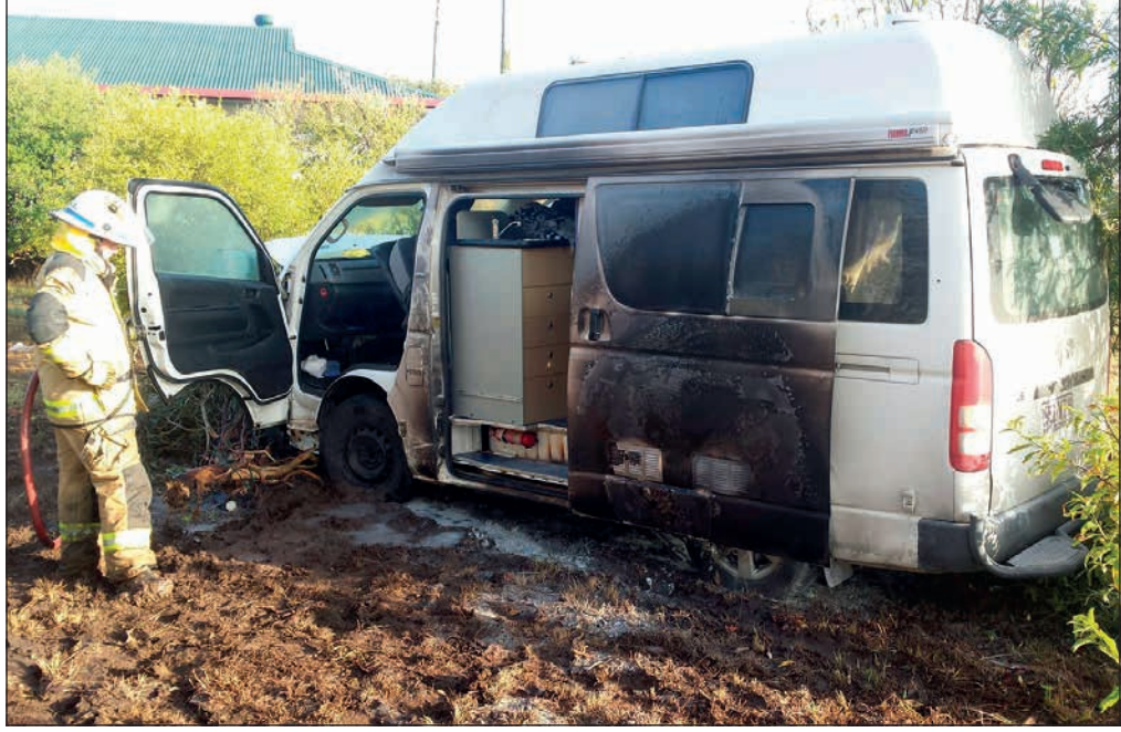
No charges were laid in relation to the incident.

A passing motorist stopped to put out the fire, before leaving the scene.