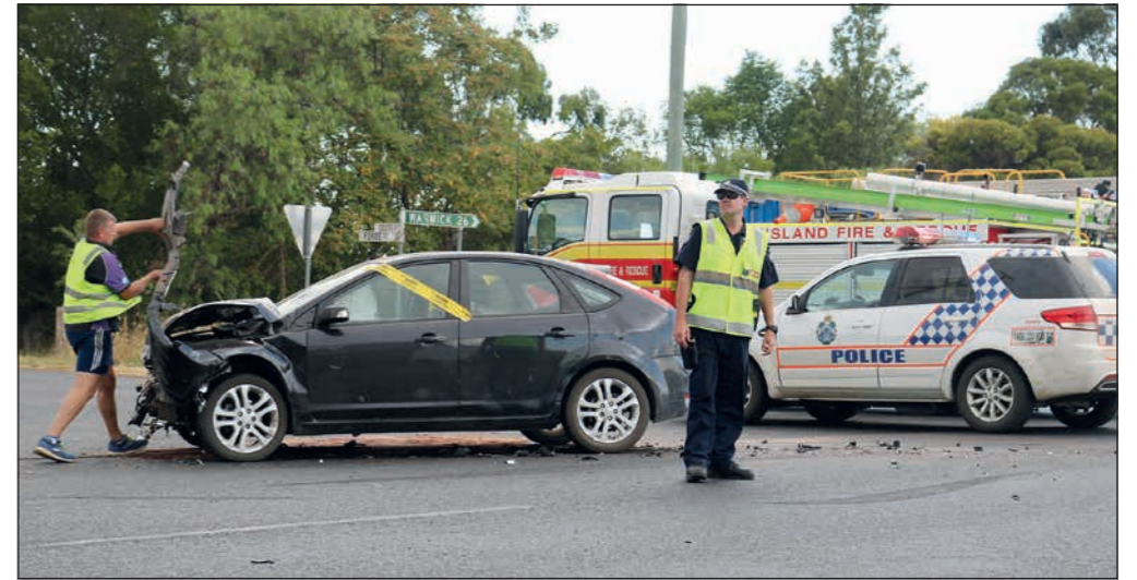
Police and firefighters on scene of the two vehicle crash at Forde Street and Dalrymple Creek Road.

Both persons were uninjured and did not require treatment by paramedics.