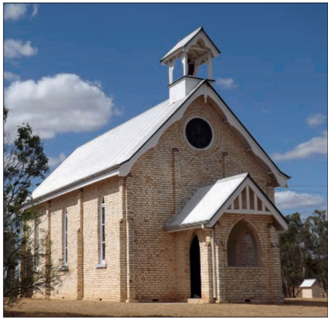
Sacred Heart Church at Deuchar.

The Sacred Heart Historical booklet will also be available for purchase