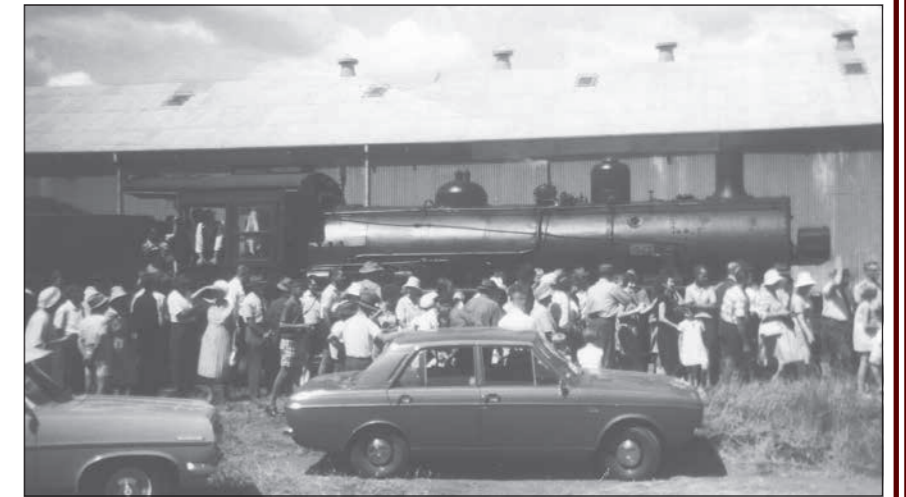
1969 excursion train to Allora in the Allora railway yards.

Names of servicemen with connections to Allora which appeared on the Honour Roll published in the Courier-Mail on 10th March 1944 are: Sergeant W. N.