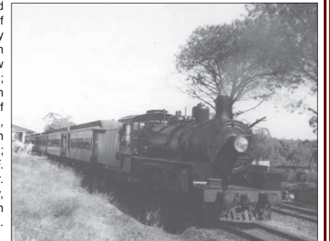
The train leaving Hendon station.