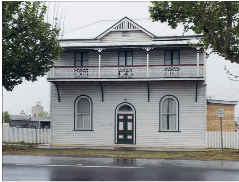
Old Shire Hall, currently being renovated.

The organising committee is putting together a programme of events during the two day celebration. Entertainment on Saturday will be in form of street musicians, highlighting the talents of Allora and district people ; story-telling by our locals or former residents; school displays; window displays; a trail of walking tours; demonstrations of traditional crafts and sale of local produce and crafts (Meet the Makers.) Members of