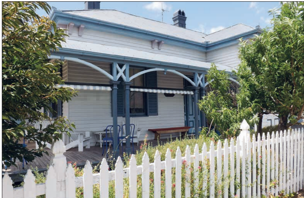
The "Mary Poppins" house.