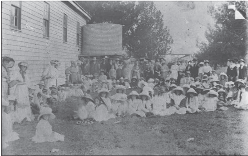
A gathering at the Allora Showgrounds in the early 1900's.