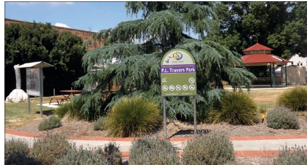
P.L. Travers Park in Herbert Street.