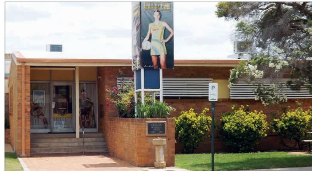
Allora Regional Sports Museum.