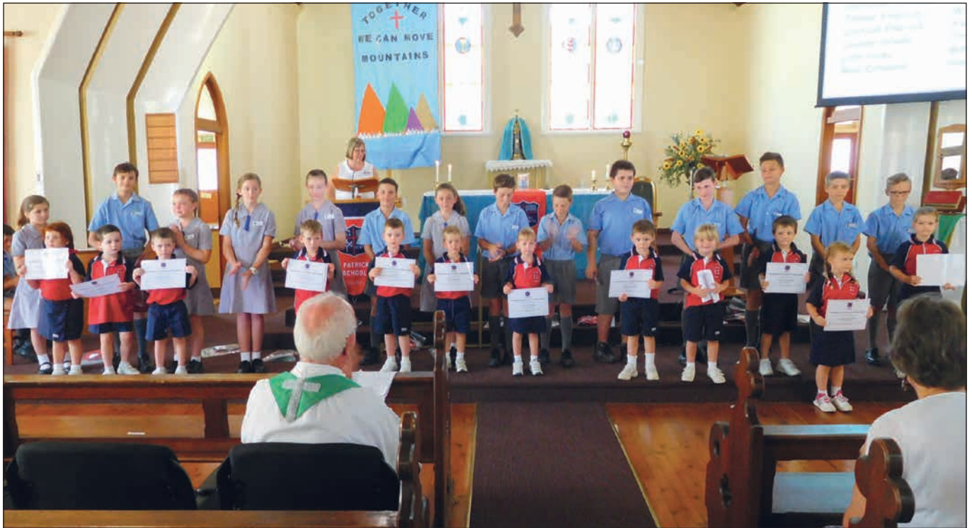
St. Patricks School Leaders and Prep students at the celebration for the start of the school year.

St Patrick's School at Allora celebrated the beginning of the 2019 school year with an induction of