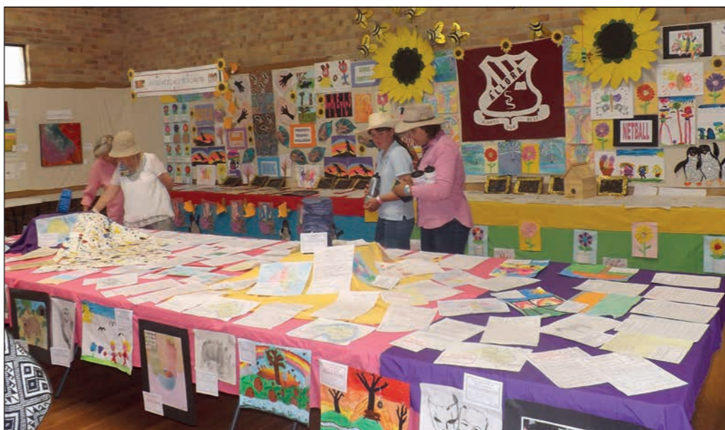
ABOVE: Display by Allora State School in the pavillion.