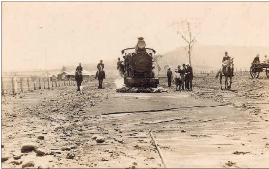
The Goomburra train bogged in silt over the line at Kunda.