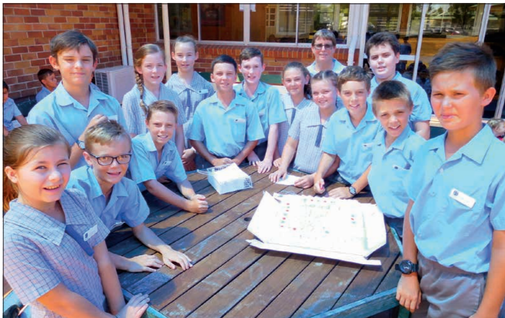
St Patricks School Leaders.

"Anyone who is considering St Patrick's as a