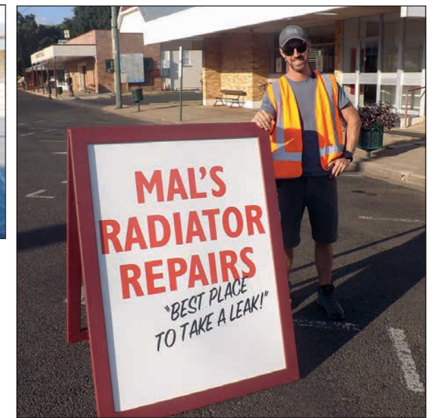
New business names appeared in Allora with the help of some set dressing.

DISCOVER THE ADVANTAGES OF USING A REGISTERED EXPERIENCED INSURANCE BROKER Rural Insurance Specialists