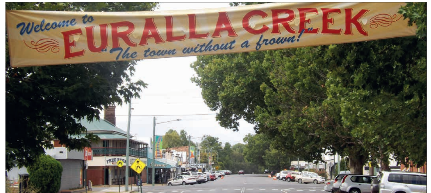
ACTION! In addition to Allora's Annual Show happening this Friday, it was also "Showtime" in Allora on Monday when film crews converted Herbert Street into the fictional town of Euralla Creek for the hit TV show Harrow.

Australian television drama series Harrow filmed at Allora on Monday, with Herbert Street and the Railway Hotel to feature in a second season episode.