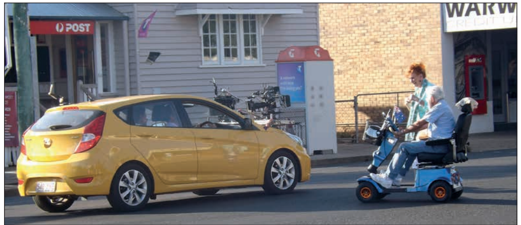
A scene being shot in Allora's main street.