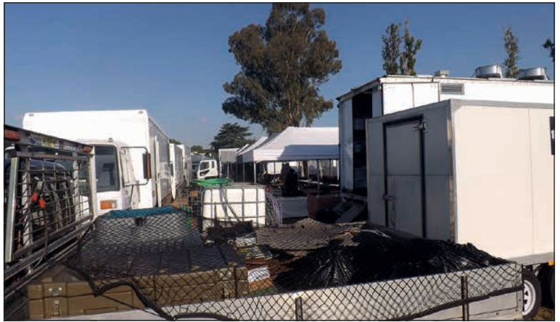
Location shooting always brings with it a plethora of trucks and trailers and Monday's shoot was no exception.

A release date has yet to be announced for the second season of Harrow.