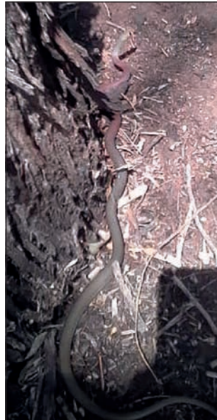
This snake was spotted last Thursday morning at Allora's Stuart Henry Park, within stumbling distance of children's swings, so keep all eyes open!