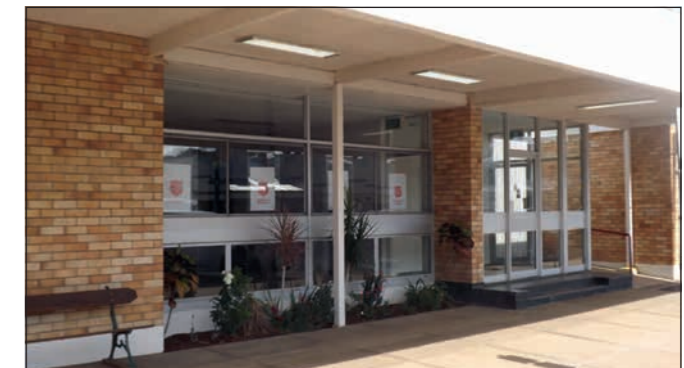
The former NAB Allora Branch building is set to house the Salvation Army store.

“We want to see how we can support the community through the shop.” An opening date for the store has yet to be advised.