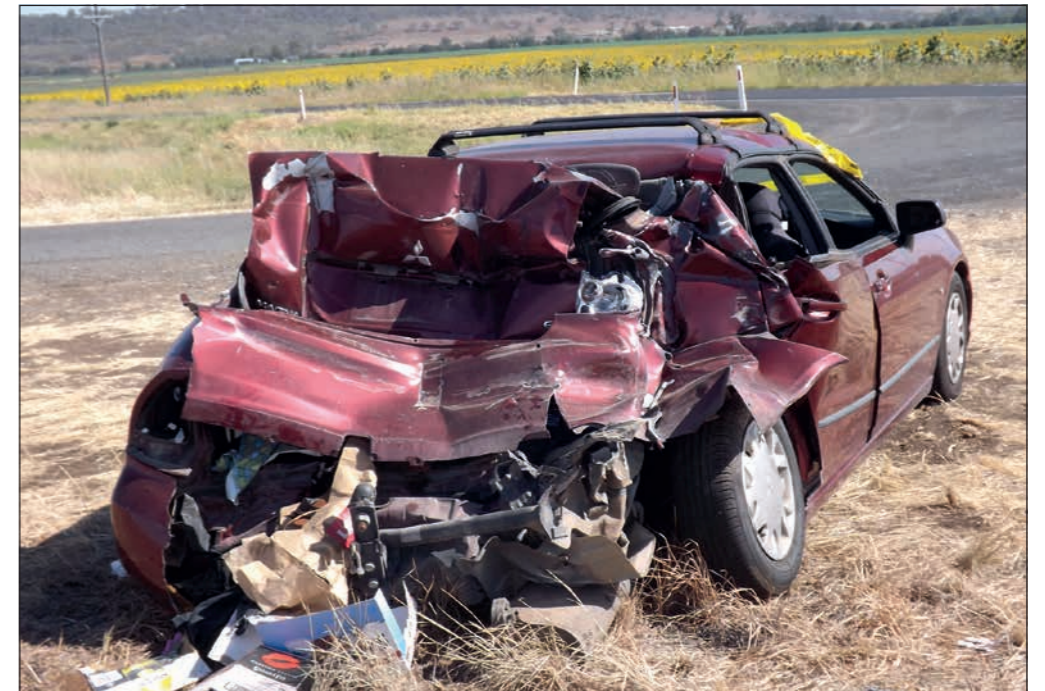
Multiple vehicle crashes have occurred near sunflower fields.

It involved a southbound vehicle being driven by a