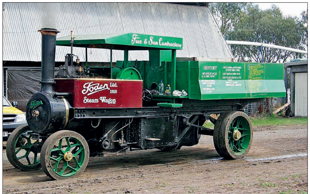
The 1918 Foden Steam Wagon will make an appearance at this year's Allora Heritage Weekend.

For those who would like to see things from above,