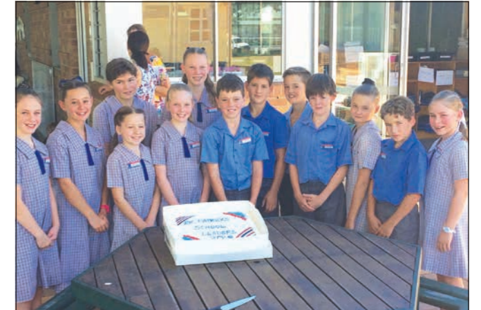
School Leaders starting another new year at St. Patrick's School Allora.