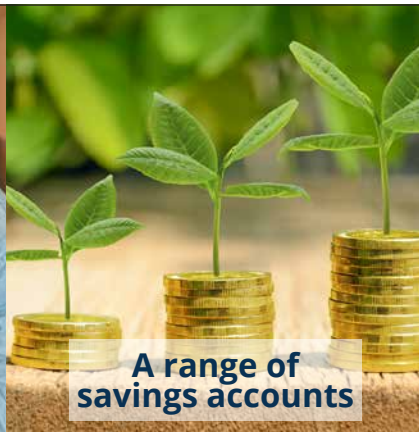
A range of savings accounts