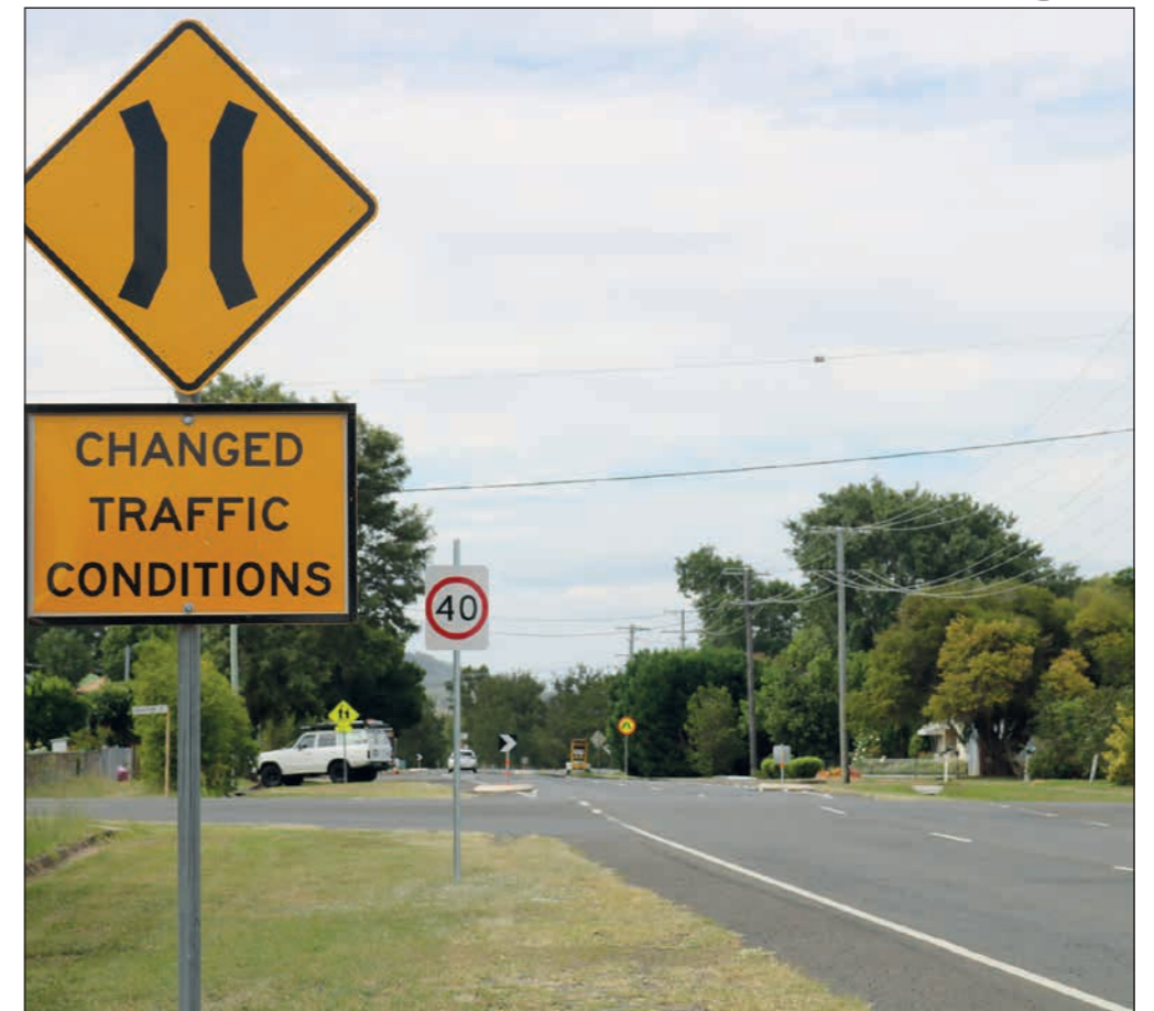
speed zone will remain and is enforceable."