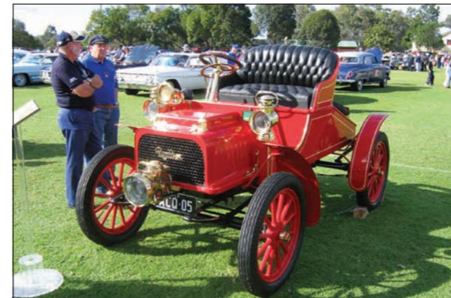
This classic 1904 Rambler will reveal an amazing history at the 2018 Allora Heritage Weekend