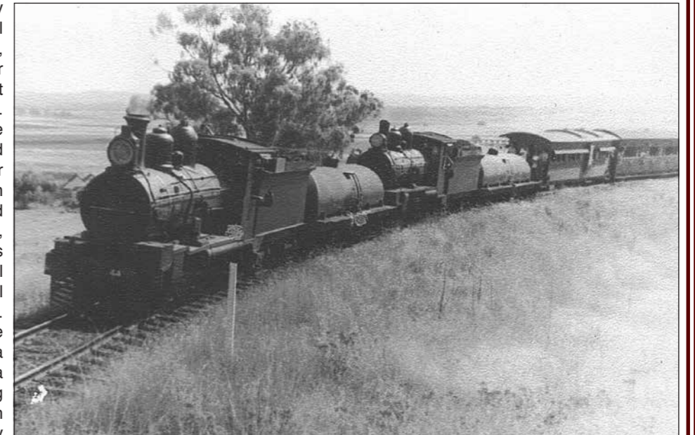
A double-banked steam train nearing Hendon.