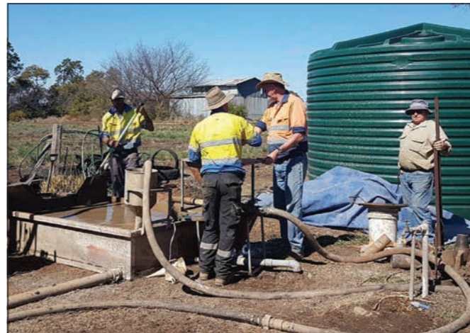
Drilling success - Water for Allora Mulberry project tapped.