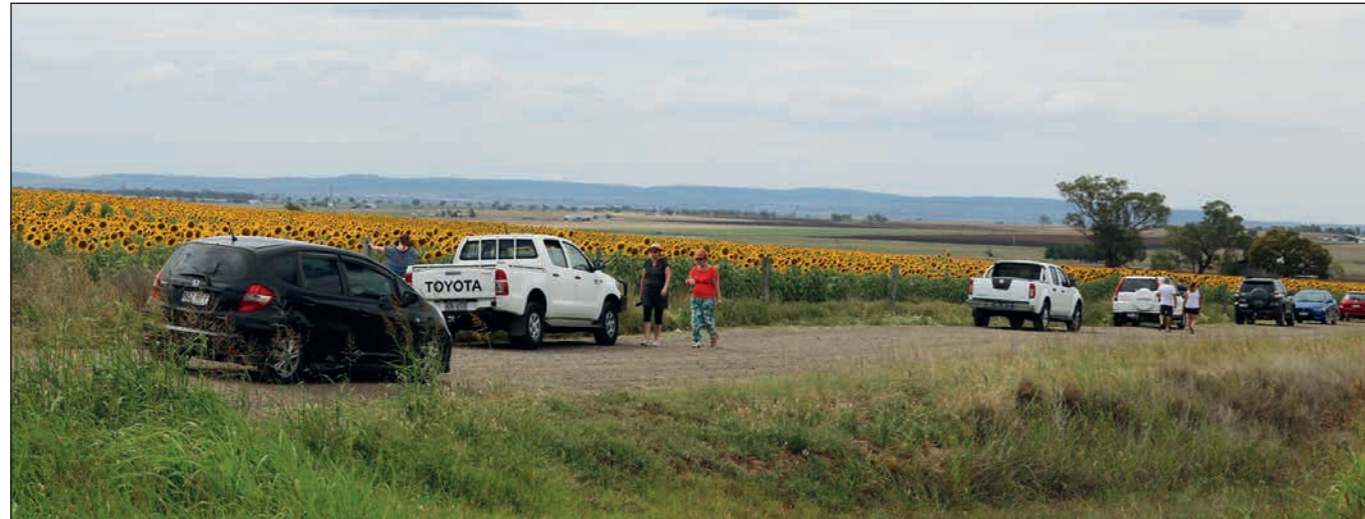
Sunflower blooms in the area are again attracting the attention of passing tourists.

A crop of sunflowers on Hoey's property just off the New England Highway north of Allora started attracting a throng of visitors at the weekend.