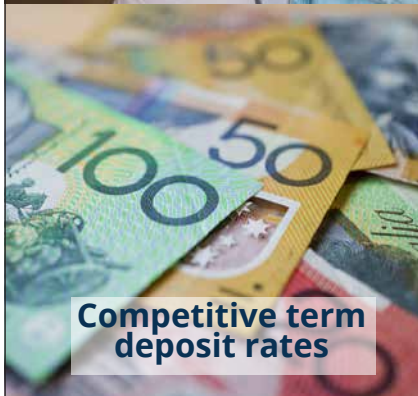
Competitive term deposit rates