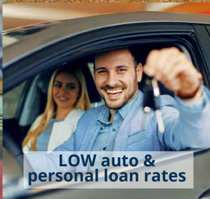
LOW auto & personal loan rates

Warwick Credit Union We are YOUR local banking solution