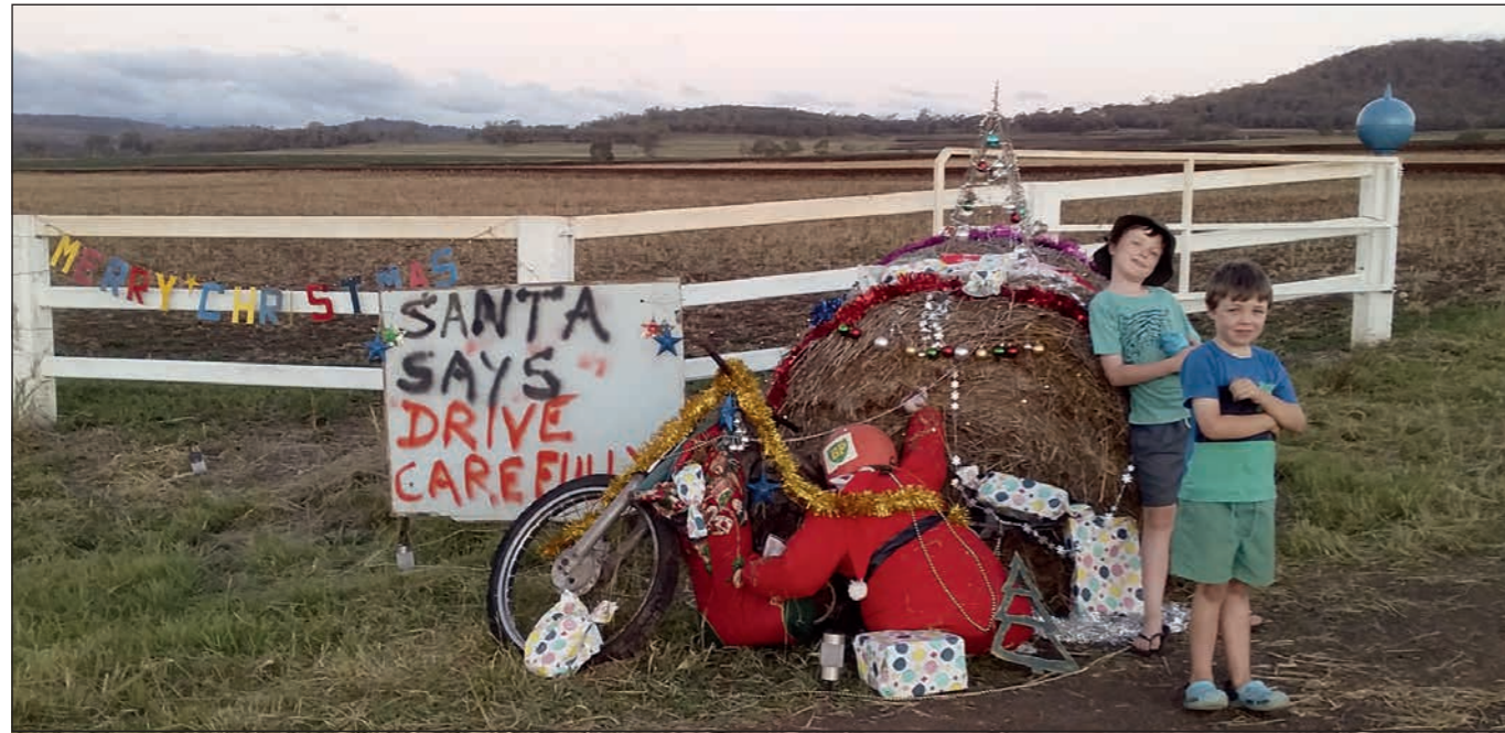
Santa crashes at Berat Forest Springs Roads. Lachlan and Connor investigate.