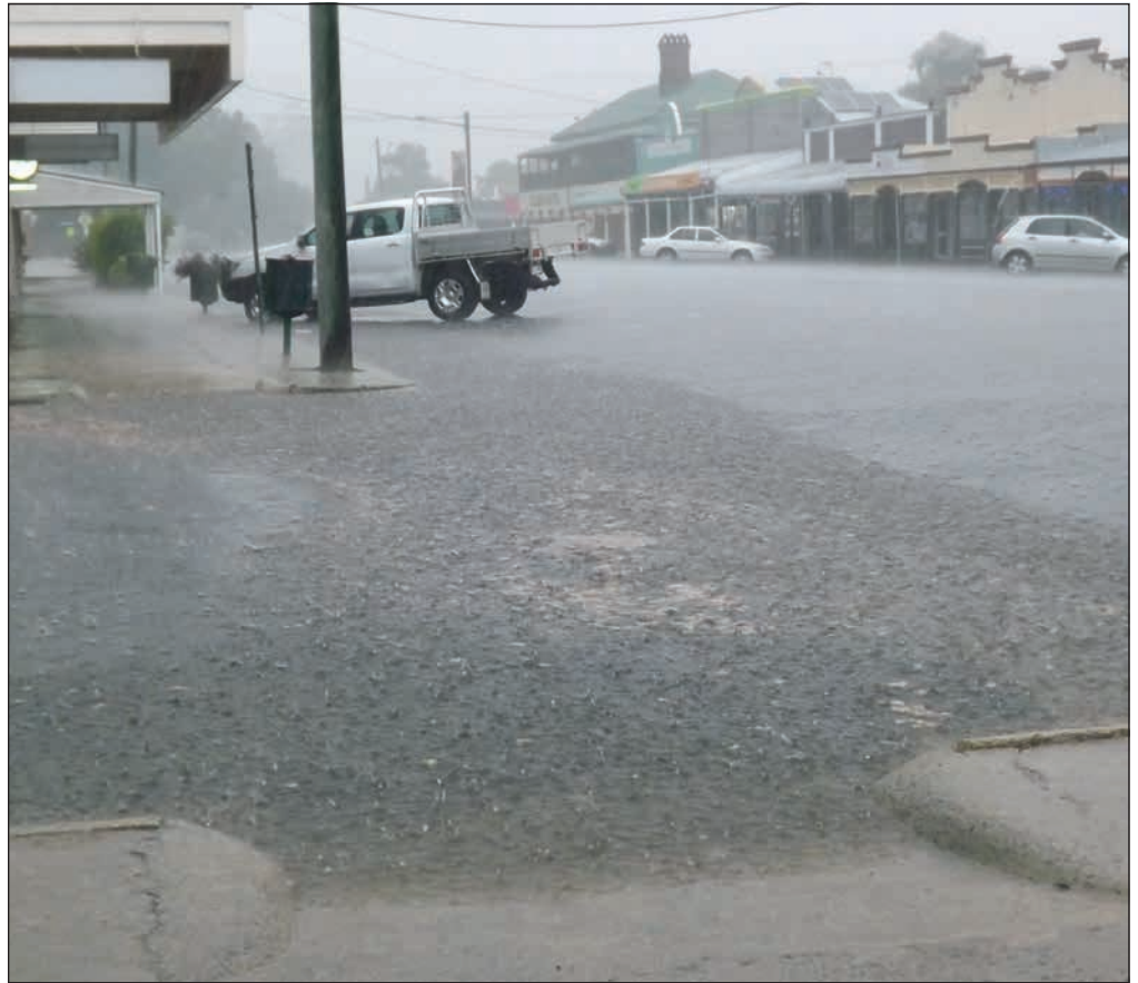
The deluge of rain which resulted in the cancellation of this year's Allora Bush Christmas spans Herbert St.