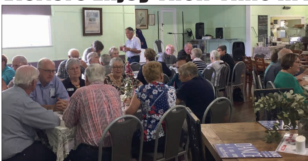
Toowoomba West Probus Club enjoyed lunch in the Allora RSL Cafe