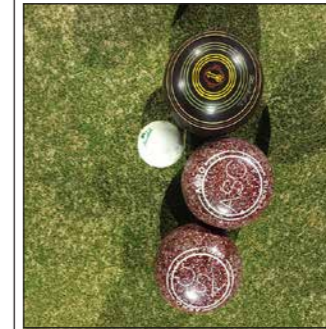
Note well - Lyn's 3 black bowls at rear, Kaleb's bowl kissing the jack. Kat's two pink bowls. No blue bowls to be seen!