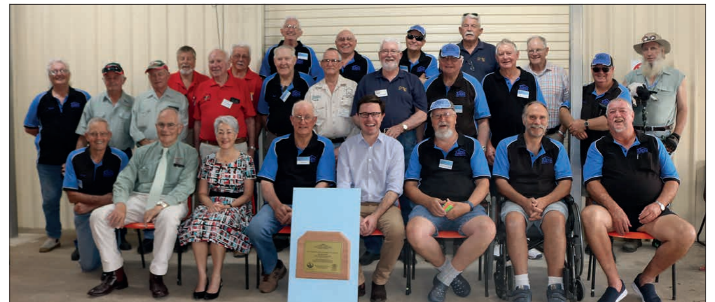
Allora Men's Shed members and dignitaries celebrate the added extensions to the Men's Shed complex.

Allora Men's Shed (AMS) members, dignitaries and the wider community celebrated the opening of the revamped shed complex on Saturday.