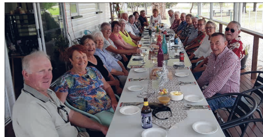
ADHS Christmas Luncheon - Members of the Allora & District Historical Society enjoyed their Christmas Luncheon on the deck of the RSL on Sunday. The company was great & the meal was delicious. 2019 will be a big year for the society with our 150 year celebrations as well as setting up the Warwick St museums after the renovation of the Old Shire Chambers. Please think about joining our association to help us achieve these goals & our future as caretakers of our heritage. We will welcome you with open arms.

"There is an extraordinary range of programs available from the federal government, state government, businesses, banks for farmers to make use of, the challenge is getting all that information delivered in a easily-accessible, coherent way, so that farmers are aware of what programs are available, what might be suitable for them and how they go about using them."