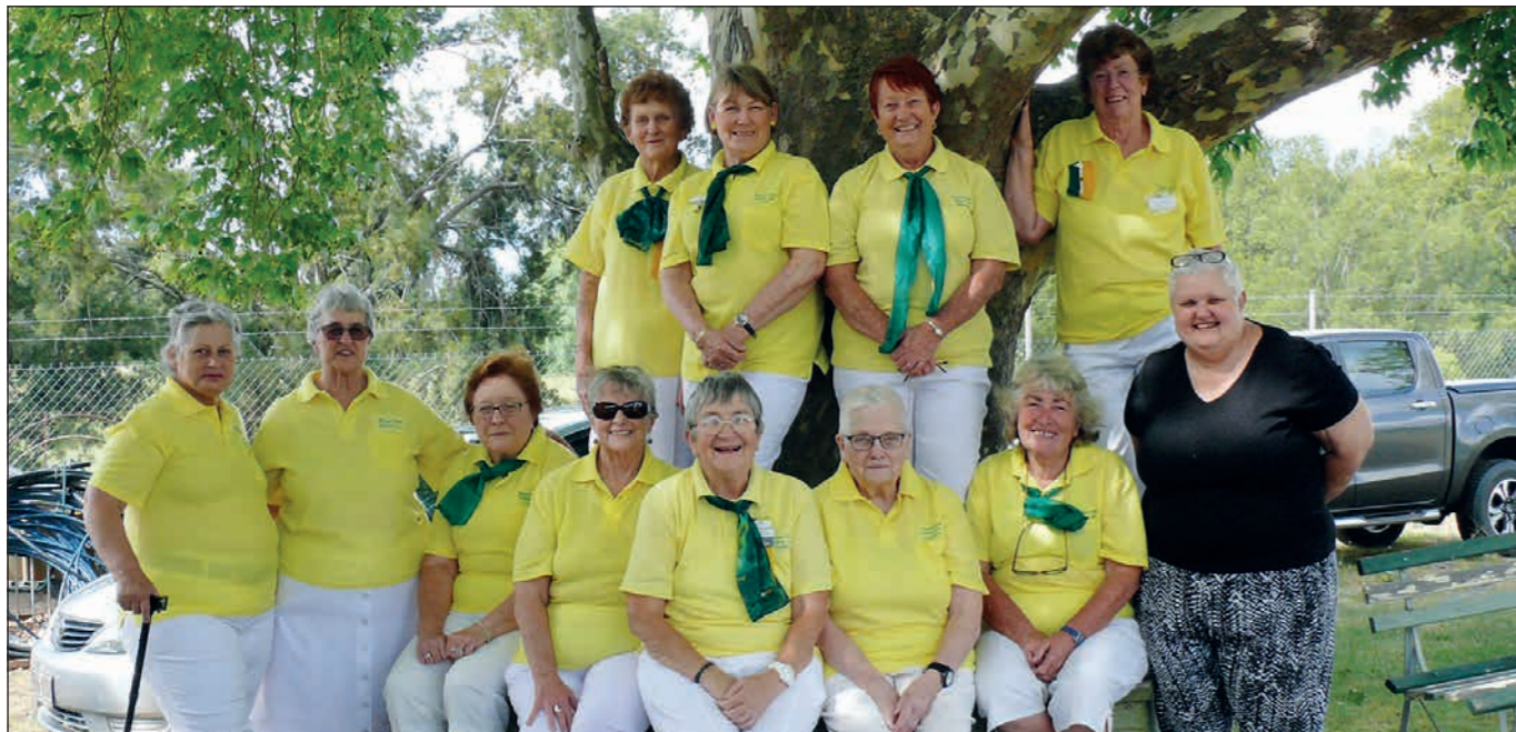
Allora Men's Shed Official Opening - Members of the Scope Club of Allora Inc. who served afternoon tea for the Official Opening of the new Allora Men's Shed on Saturday. See full story on page 3