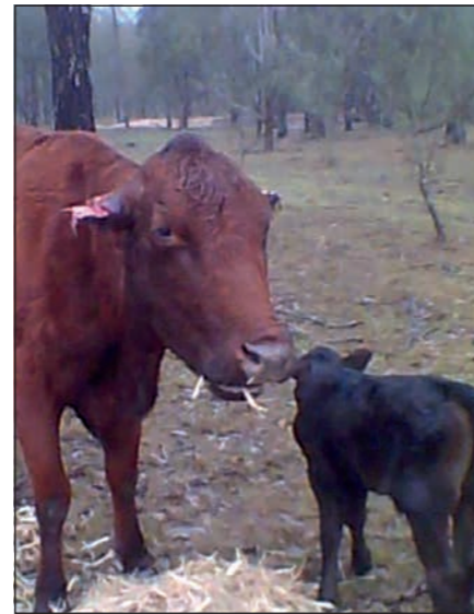
Cattle injured by wild dogs.

Council also conducts landholder training and planning