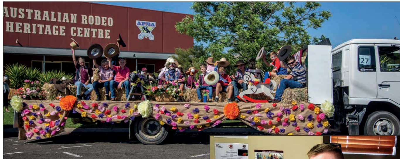
Allora State School winning float entry for SDRC Warwick Rodeo Street Parade.