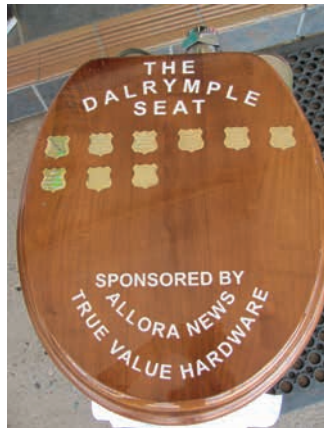
The Dalrymple Seat Trophy - Don't miss out on all the action of the Dalrymple Seat Golf & Bowls day held in Allora on Saturday, 3rd November.

Get your nominations in at Allora True Value Hardware or Allora News or call 4666 3318