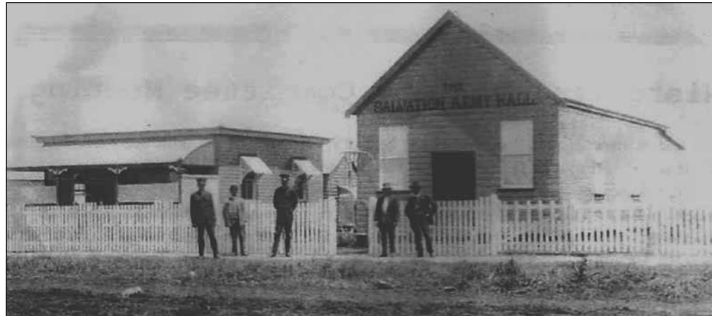
The Salvation Army Hall and residence in Forde Street (the residence still stands next to Michael Maher's)