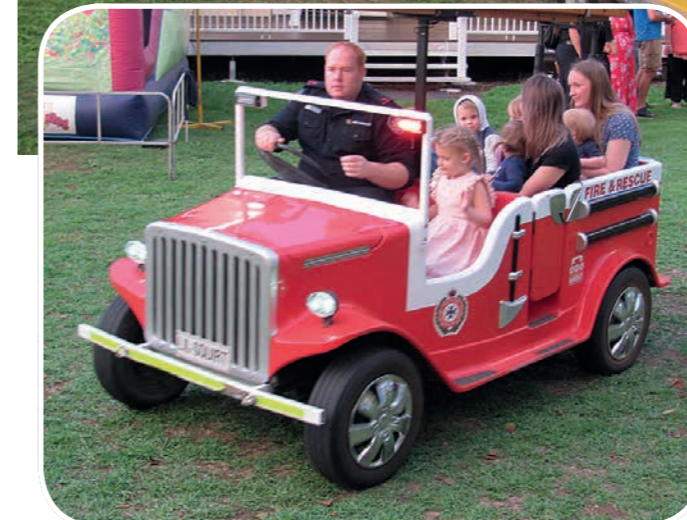
ABOVE: Lil' Squirt the fire truck offered rides for the kids.

LEFT: Pete's miniature cars were a popular attraction with the kids.