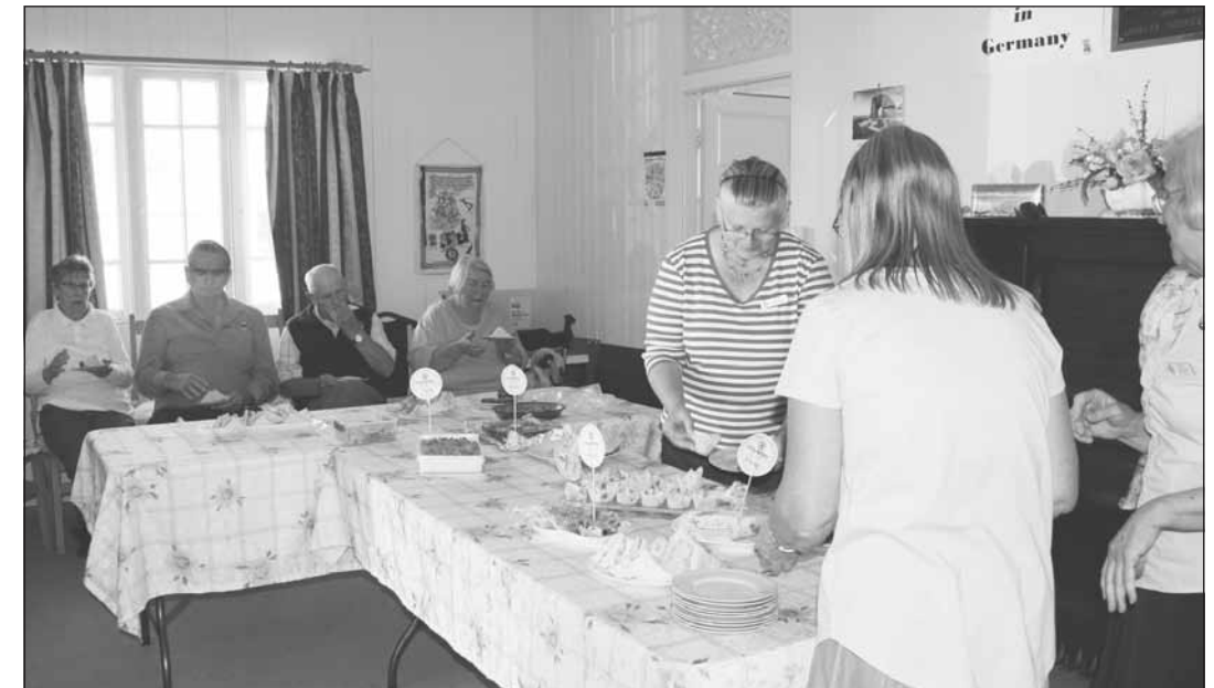
A healthy lunch was prepared by the Allora CWA during the doctor's visit.