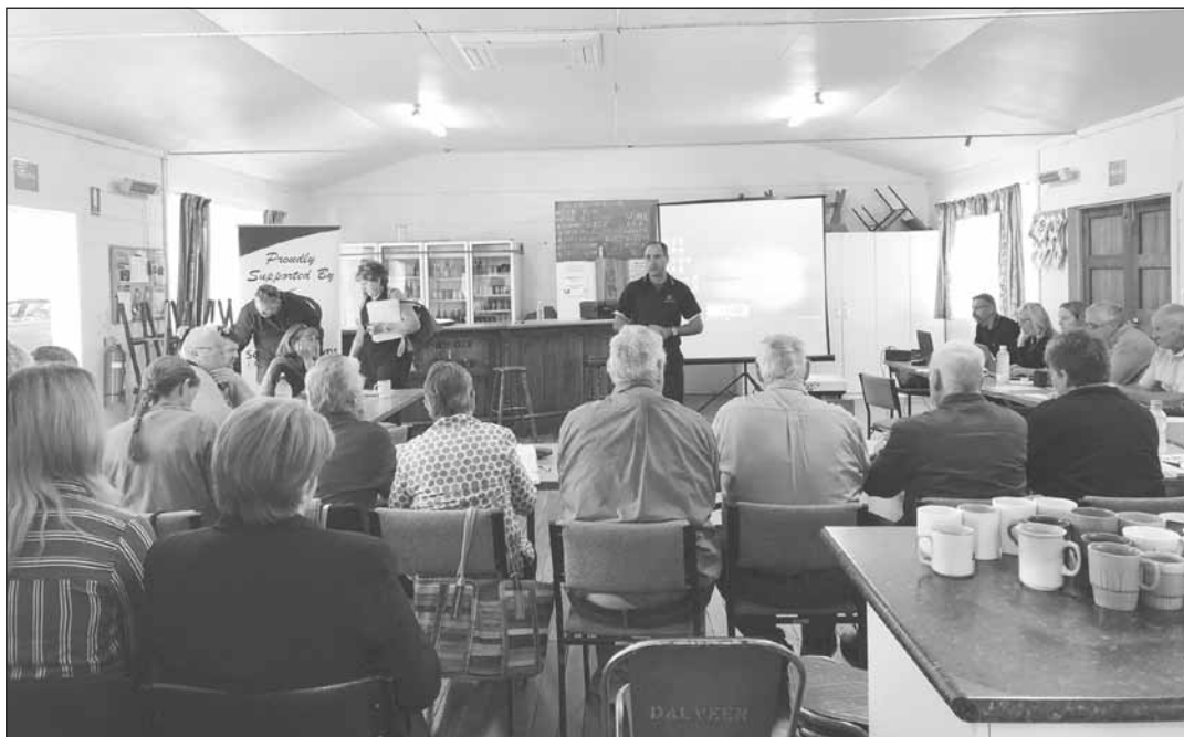
More than 50 people from government, non-government, banking and not-for-profit organisations attended an inaugural inter-agency meeting in Dalveen.