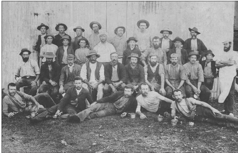
The Goomburra shearing team in the 1890's.

To raise funds for the Allora branch of the Red Cross Society a novelty afternoon was recently held in the Shire Hall and as a result approximately £7 has been added to funds. A jumble stall was conducted by