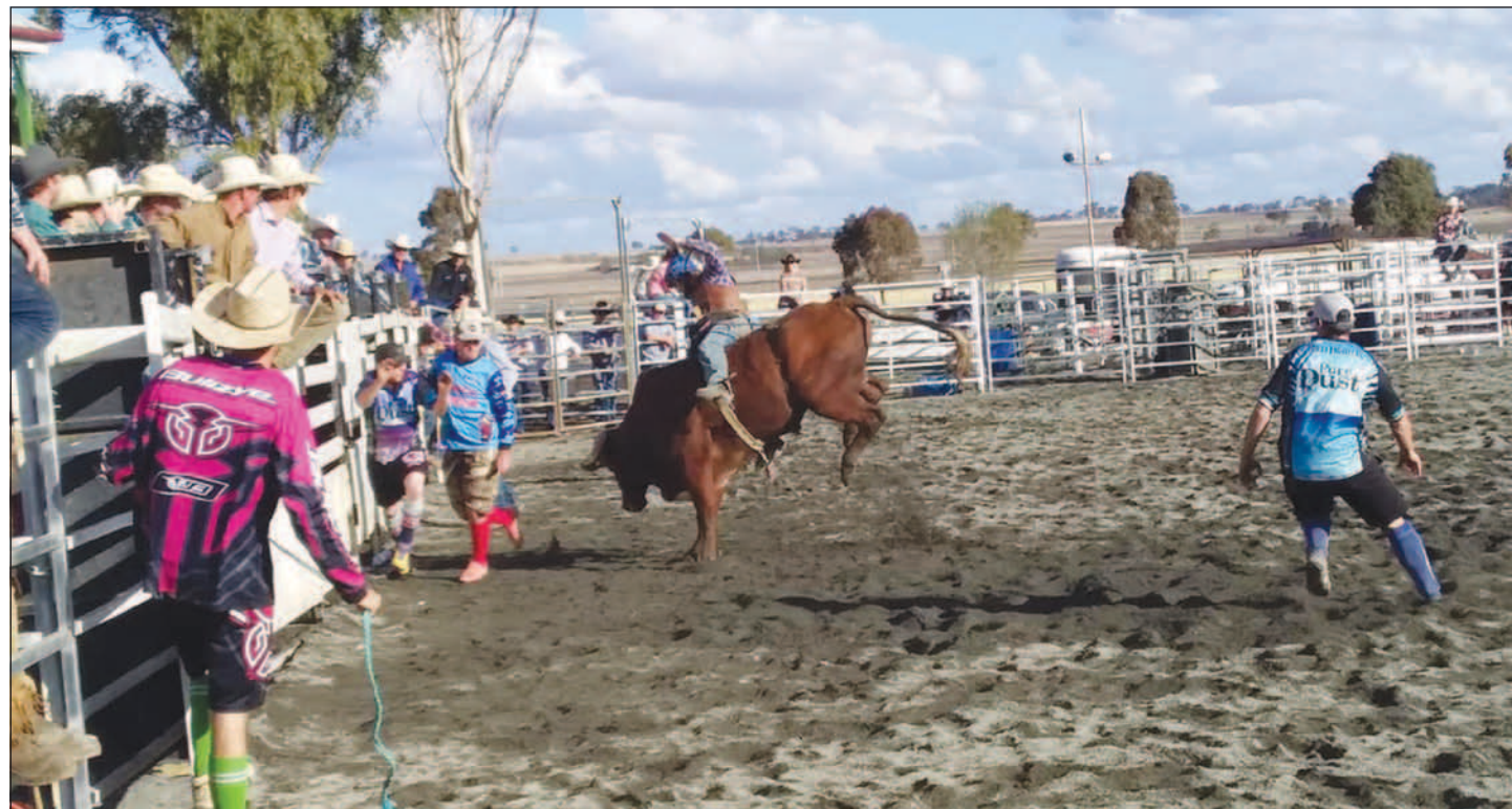
Action from the 2018 Allora Show Society Rodeo.