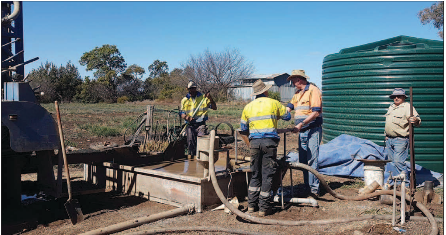
Drilling success - Water for Allora Mulberry project tapped.

Exciting news! In Allora - WE HAVE WATER! The drill rig found water last Friday, 10th August, in gravel and ancient seashells at 22m. The team are going down to around 30m to build the sump. On Monday we had a clear stream. What a