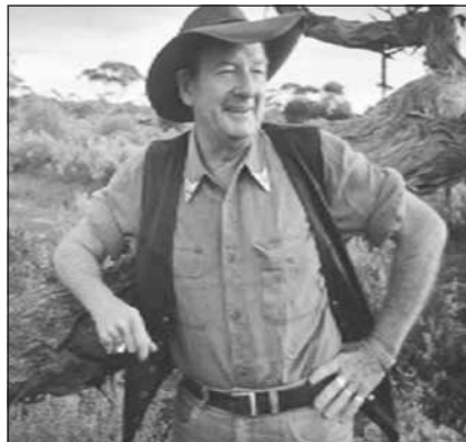
Slim Dusty is a genuine Legend in his own lifetime & beyond.