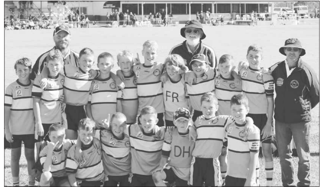
Central Downs U43kg team.

Friday Duck Run - Hit off any time after 2 pm. Sunday - 4BBB Stableford. Names in by 11 am. Hit off 11.30 am. Tuesday - Social Golf - names in by 9.45am. Hit off 10 am. Play 9 or 18 holes.