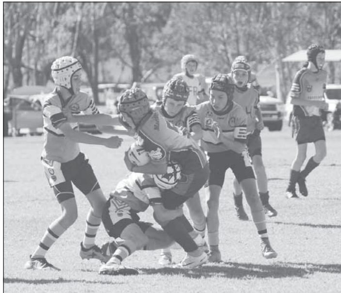
Action from the Central Downs U43kg Carnival held from Monday, 9th July.