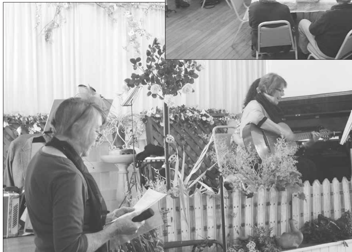
ABOVE: Happy crowd at the Country Garden Afternoon Tea in June at St. David's Hall