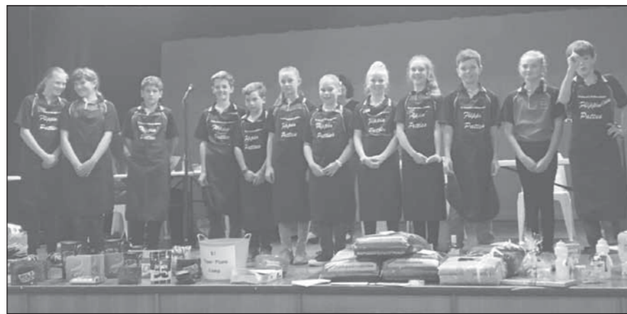
The year 6 helpers for the Rattle of the Brains Trivia Night.