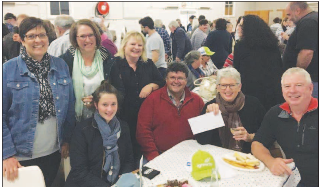
The winning team 'No Idea at All'