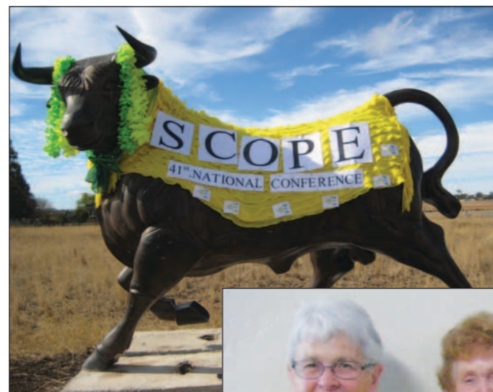
ABOVE: Decorated Bull sculpture advertising the 41st National Conference of Scope Clubs can be seen on the Allora- Warwick Road