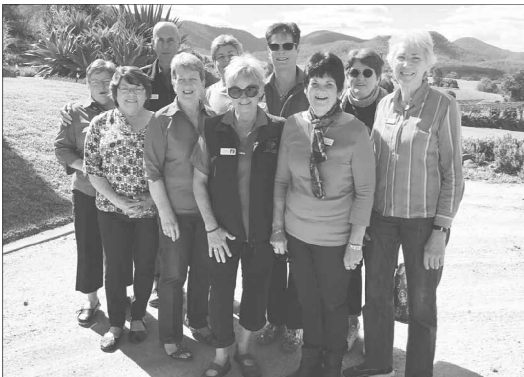
Visitor Information Centre volunteers.