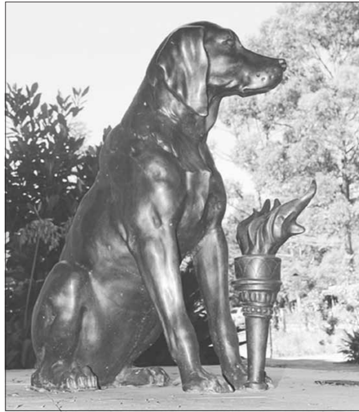
Local Legends come in all forms! It can be a sporting star, a pillar of the community, an unlikely animal hero, a fictional character - anything!

"The stories expressed through this project bring people together," says Gillie, "Not just residents, but we've seen that even tourists who come across the sculptures