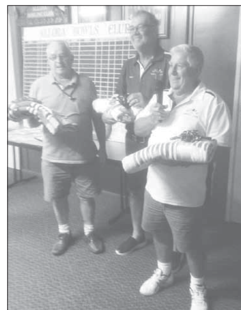
ABOVE LEFT: Clifton wins the Allora-Clifton Clock – winning Clifton team at presentation.