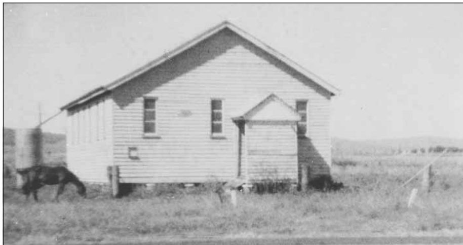
The Spring Creek Hall.