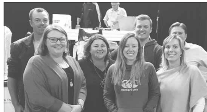
Last year's winning team 'Wheres Ben?'.

Prizes on the night include $300 for the winning team, $200 for the 2nd placed team and $100 for the team that finishes 3rd. There is also a prize for the wooden spoon! There will be a multi draw raffle which will be drawn throughout the night, as well as a very entertaining auction. If you'd like to come along to this fantastic event you can nominate a Team of 8 by phoning the St Patrick's, Allora