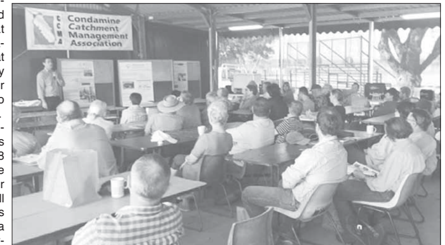
Allora Landcare Group hosted a Field Day at the Showgrounds last Friday.

Allora Landcare would like to thank our major sponsors, Bunnings Warwick and Condamine Catchment Management Association, and also Allora IGA for their generosity.