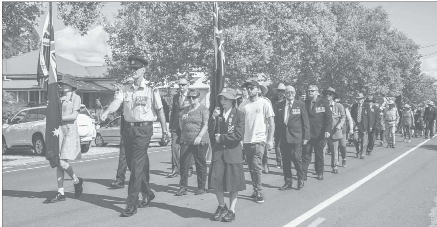
ABOVE & BELOW: Anzac Day parade down Warwick Street, Allora.