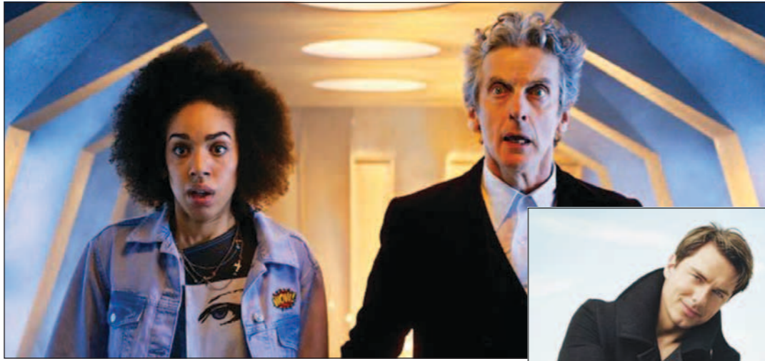
Pearl Mackie (Bill Potts) and Peter Capaldi (12th Doctor) will be at Supanova.

This month sees two great events for local "Whovians" with the Doctor Who Club of Australia Family Picnic this weekend and a group bus trip to Gold Coast Supanova Comic Con & Gaming Expo. The bus trip which has been organised for Saturday, 28th April, provides a rare opportunity for local fans to meet the outgoing 12th Doctor Peter Capaldi in person along with Pearl Mackie who played his onscreen companion "Bill Potts". This will be the first (and possibly last) time that this particular Timelord has visited Queensland.