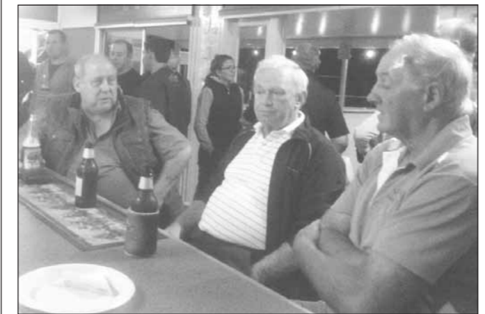
"The Old Boys" drowning their sorrows at the bar.