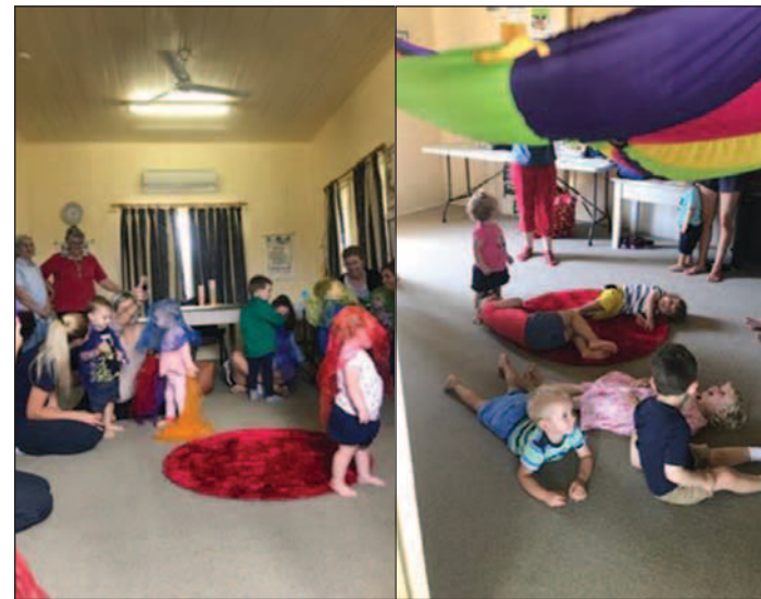
Once Upon a Song musical activities: Left - Scarf Hiding, right - Parachute Play.

other parents, a time to make new friends and support each other in the parenting role. Children and Parents can enjoy an all-round sensory experience, with the opportunity to be seeing, touching, listening, singing and moving.