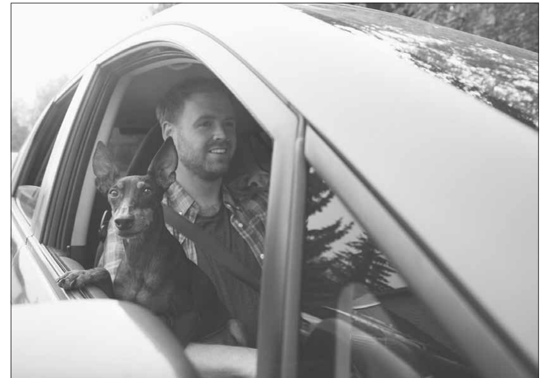
Even though Fido may enjoy the wind in his face, riding like this could get you fined.

*Data collected by Queensland Police between 1 November 2016-31 October 2017.