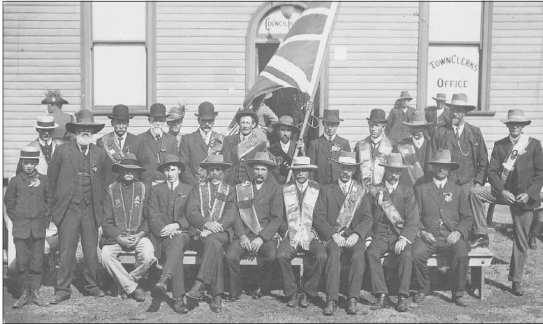
The Loyal Orange Lodge members taken on Coronation Day in 1911.