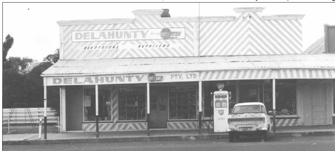
Delahuntys Electrical at 56 Herbert Street in 1972.