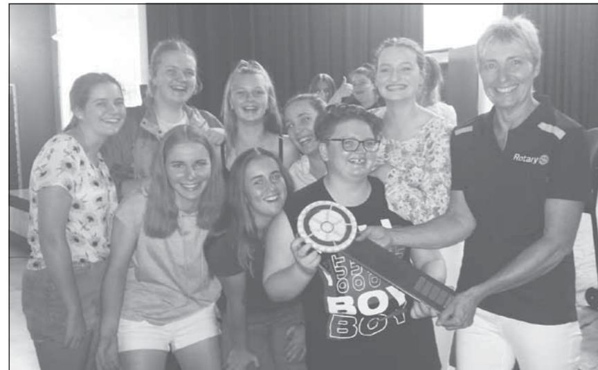
Youthful wooden spooners - Sour Patch Kids.

We look forward to seeing you all back for 2019, with the promise of new categories and new surprises.