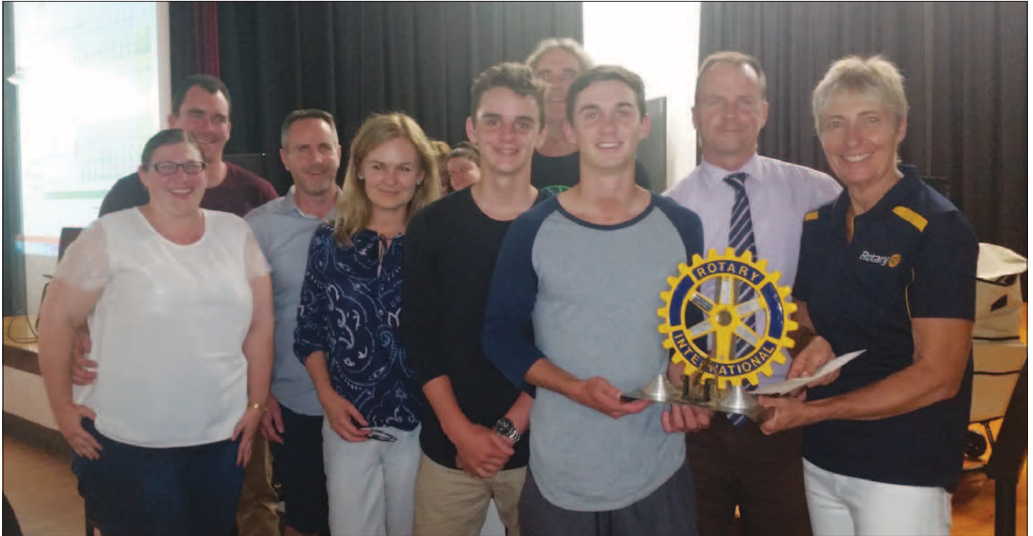
Winners are grinners – Bob's Your Uncle victors again.

How wide is Australia? If you don't know the answer to this question then you join the throngs of folk who found the baffling array of mindless minutiae of the Rotary Trivia Night on Friday night quite