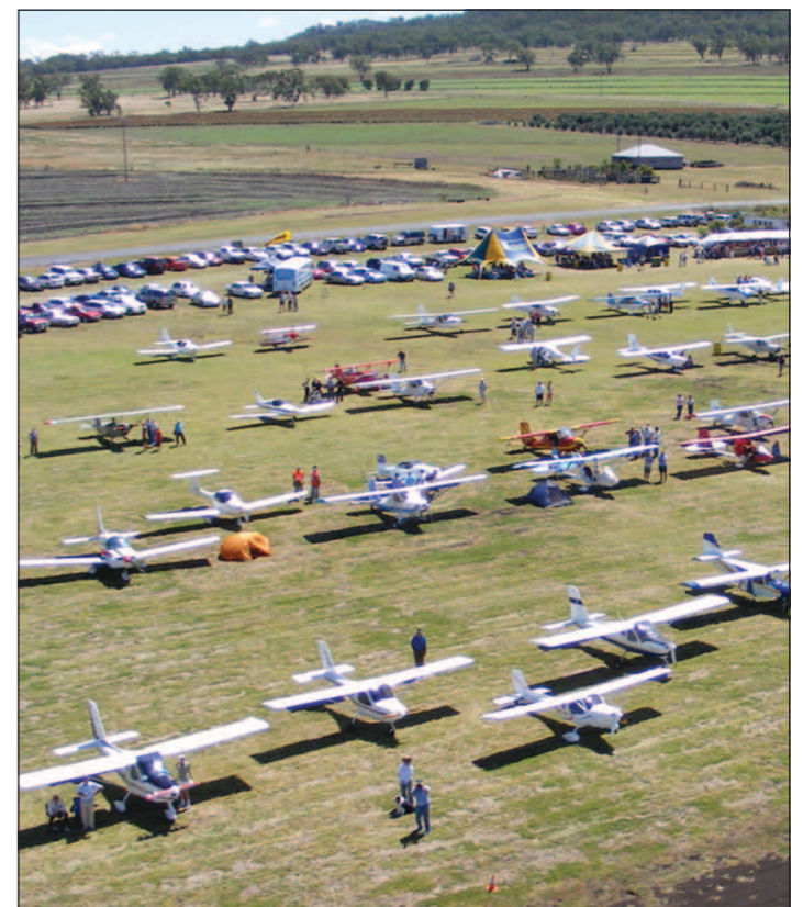
Last year approx. 130 aircraft of all shapes and sizes flew in for this great event at Clifton Airfield.

to get up close with aviations, club members and former scholarship recipients and gain knowledge. Applications for the scholarship close on 31st March 2018. Please go to our website for more information.