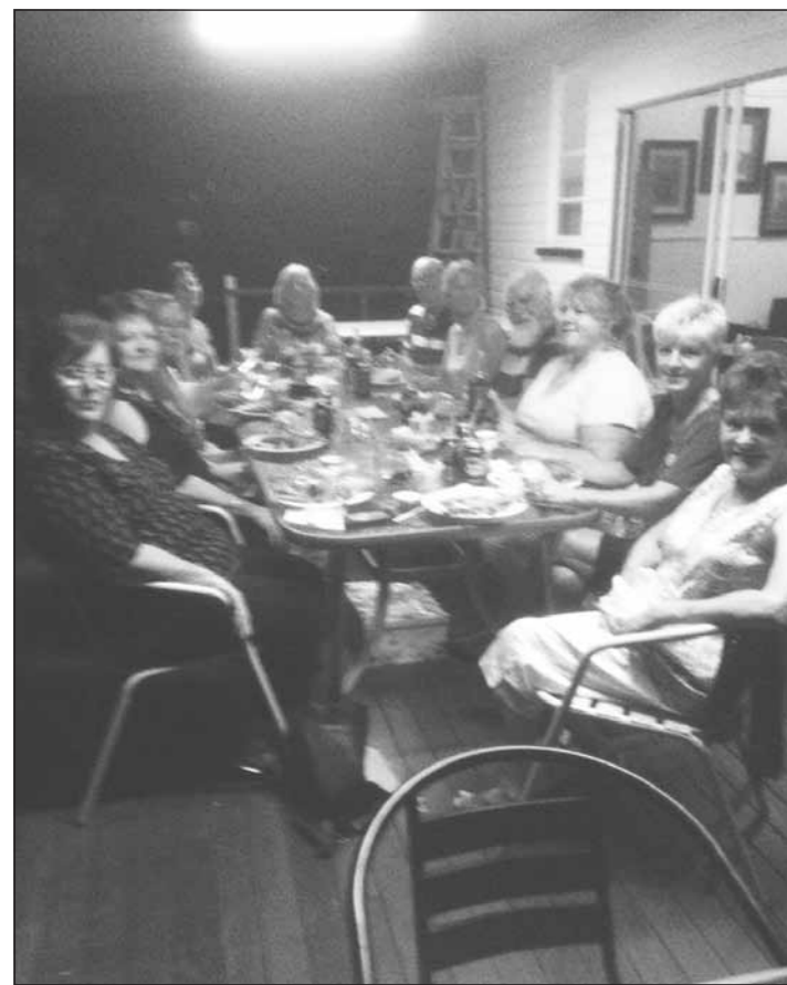
Homestead staff enjoying dinner on the deck