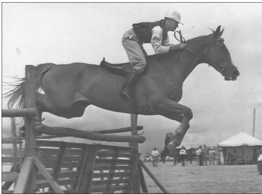
Olympic Show jumping at the 1956 Allora Show.