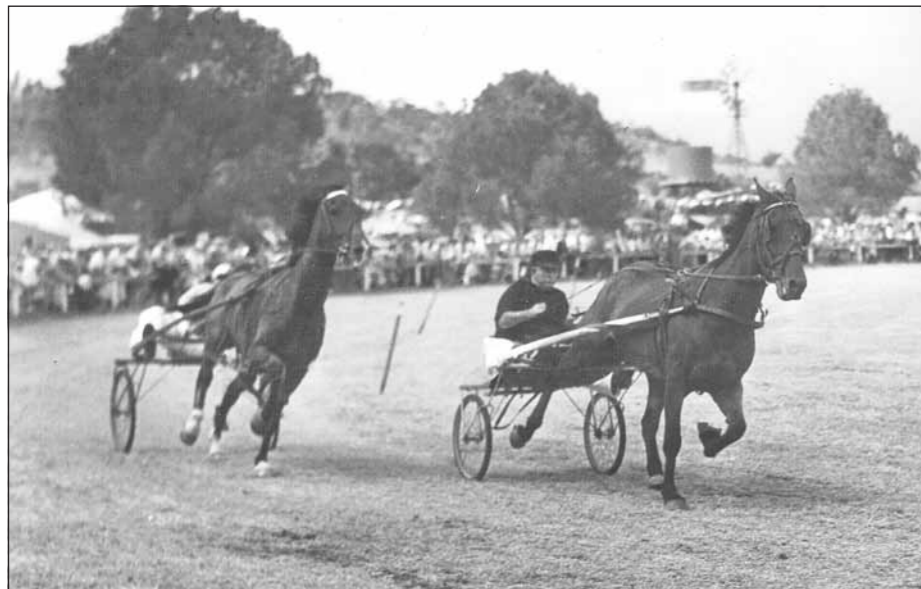
The trotting at the 1956 Allora Show.