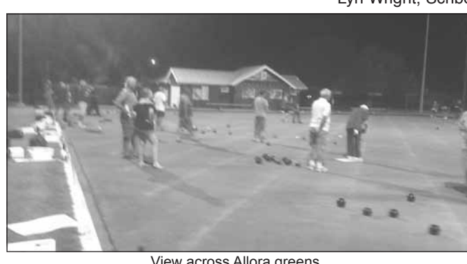
View across Allora greens

Clifton Scout Group is conducting an Open Day from 9.00 am till 12.00 noon on Saturday, 3rd February 2018.