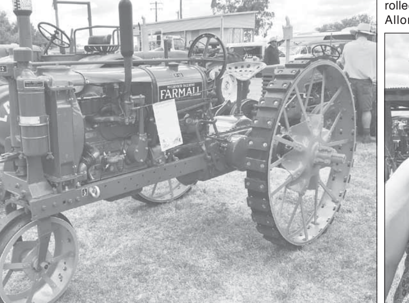
A magnificently restored 1933 Farmall F12 tractor was just one example of over 200 tractor exhibitions that took pride of place in the Heritage Weekend tractor parade.

Chamberlain and Caterpillar were two famous makes of machinery that featured at this year's classic Heritage event.