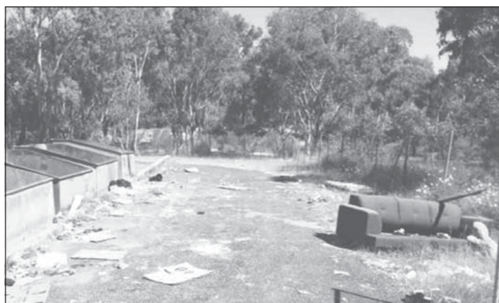
Large and bulky items such as couches or whitegoods should not be disposed of at unsupervised waste facilities.

contractors emptying bins and problems for other users of the facilities, misuse increases operational costs for Council – funds which could be allocated elsewhere."