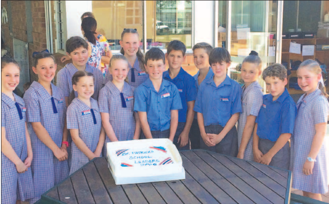
School Leaders starting another new year at St. Patrick's School Allora.