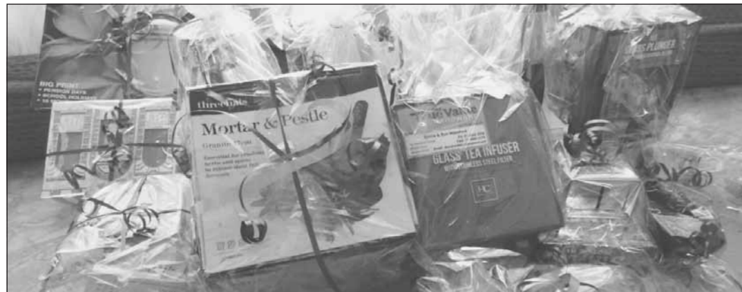
LEFT & BELOW: Examples of some of the great prizes donated by local businesses and supporters