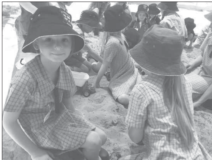
St. Patrick's School Students starting another new year.

Continued from front page... those that go to school. what makes a good learner. Students are to be learners, Students, by definition are not just students.