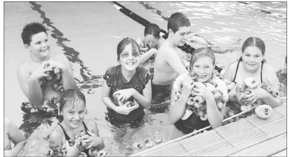
The excitement is mounting for the 21st Dalrymple Duck Race at the Allora Swimming Pool on Australia Day.