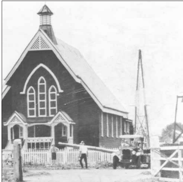
Power poles being erected in front of St. Andrew's Presbyterian Church in 1932.