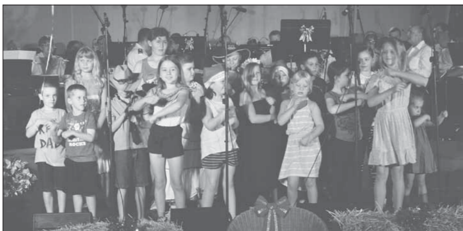
BELOW: Local kids performing at the Creekside Carols.