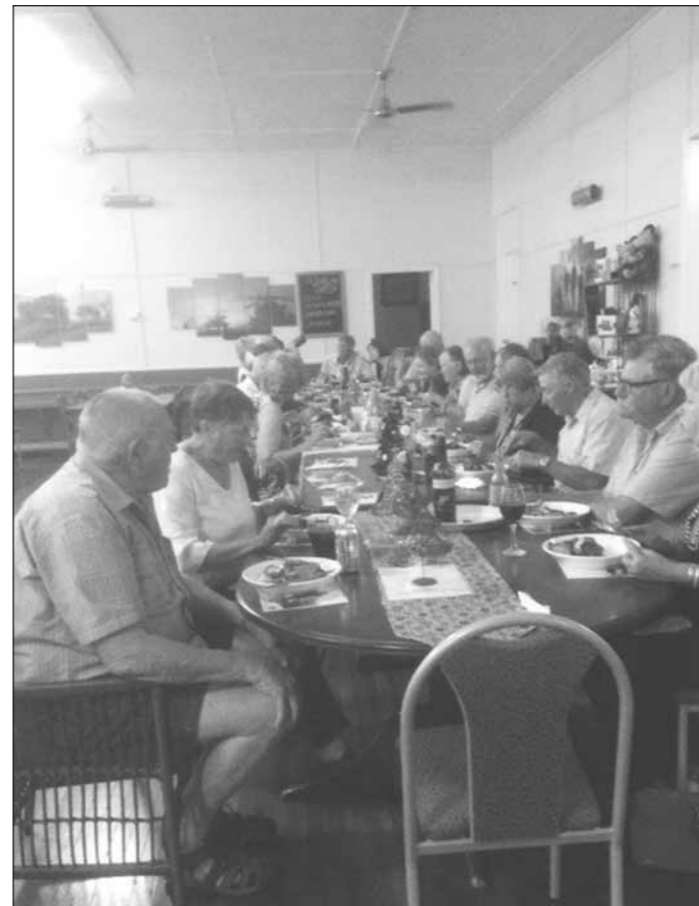
Society members at the Allora Historical Society Christmas Party held at the RSL Cafe.

Twenty two members attended the annual Christmas Party at the RSL Allora Sub Branch café-restaurant on Saturday night. It was great to see so many members enjoying the Christmas spirit at the Memorial Hall.