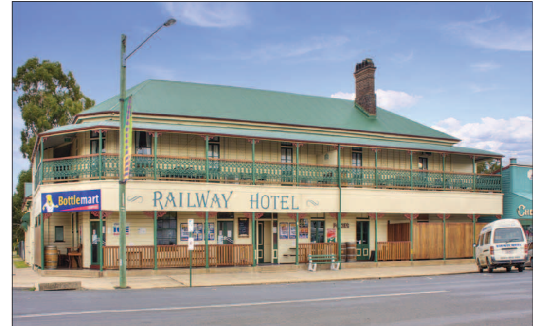
The Railway Hotel, 115 years providing social enjoyment for the Allora community.