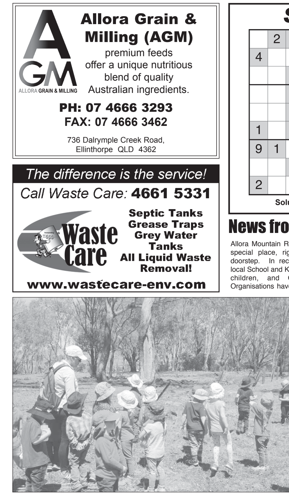
Children and Parents from Allora Community Kindergarten take time to explore Allora Mountain Flora and Fauna Reserve