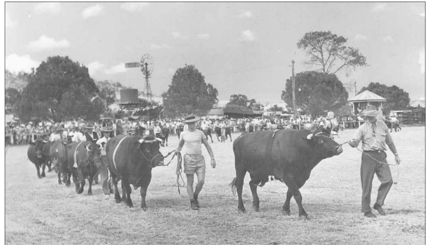
Allora Show 1956

enthusiasm, for every entrant had a "barracker" and he had to put on a good show. But the event at times bought shocked glances and demure looks from the lady onlookers - for the men ran in their underwear indeed! Truly scandalous it was, to be sure!