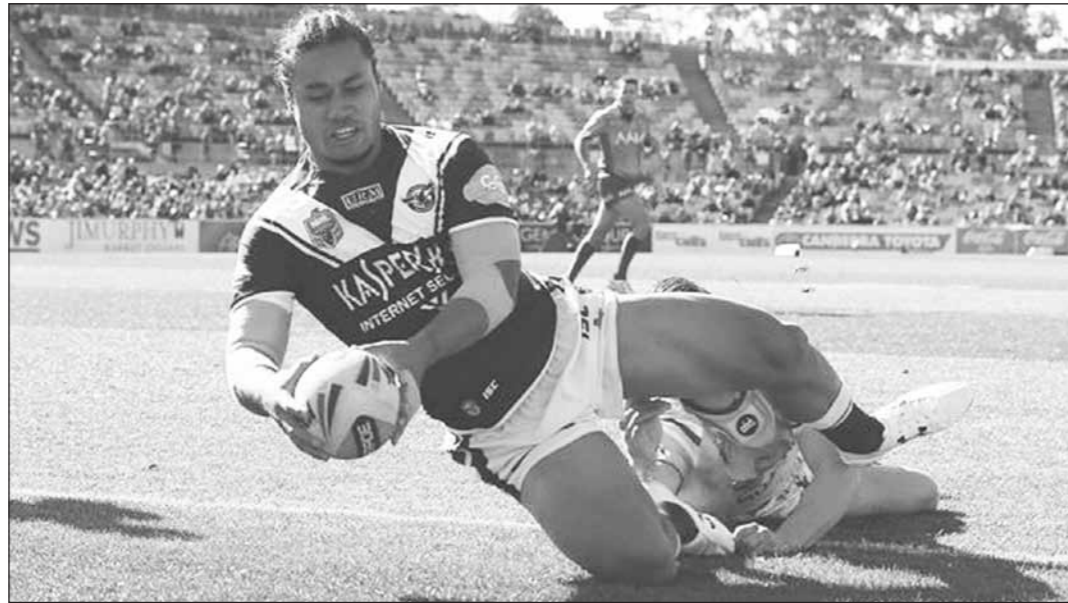
Steve Matai, New Zealand International rugby league player will be a special guest at the 2017 Wattles Rodeo.

"The annual event also gives the Wattles' club a vital financial kick along as we head in to the new rugby league season".