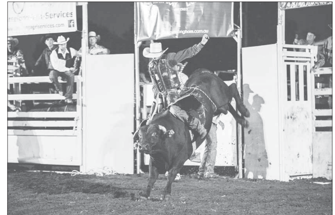
Action from from the 2016 Wattles Rodeo at the Allora Showgrounds.

rodeo students can enrol at 9.00 am on Wattles Rodeo Saturday for a more than reasonable $30.00 which includes lunch.