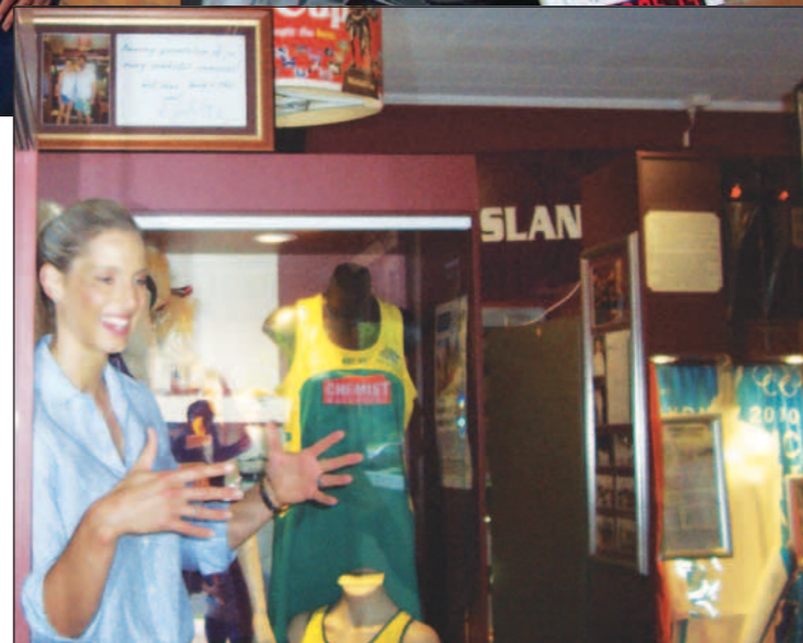
Laura Geitz alongside her display of sports memorabilia within the Allora Regional Sports Museum.

Laura's Queensland NEP Australia, the host broadcaster of the 2018 Gold Coast Commonwealth games arrived in Allora last Friday to film preview material to promote the Games. They are making 20 vignettes which will feature athlete profiles or stories surrounding the games; as well as six 30 minute preview shows. Laura Geitz, a Commonwealth Games Gold Medalist and a proud Queenslanders is heavily involved in the production of the preview material. It is important broadcasters get a feel for the host country of the Games. Laura has been asked to pick her favourite Queensland destinations which allow international viewers to get an insight into the state. In a segment that is called "Laura's Queensland", Laura has selected Brisbane, Allora, Queen Mary Falls at Killarney, and Cairns as the destinations she wants to share with the world. The Allora Regional Sports Museum proudly hosted the Team on their visit to Allora. The segments will be delivered over the next four months. The Brisbane segment went out to rights holding broadcasters around the world earlier in October, while Allora will be part of November's delivery, appearing on one of our local commercial television stations.