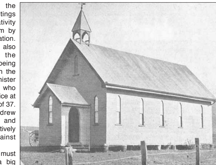
The original St. Andrew's Presbyterian Church in Forde Street